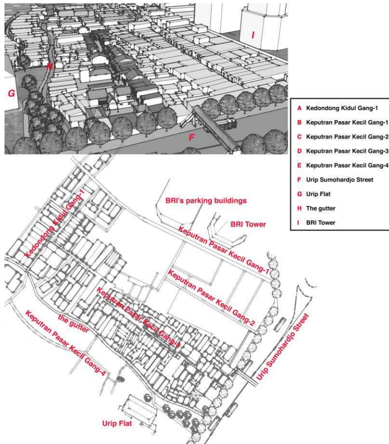
Fig.1. The map of the case study