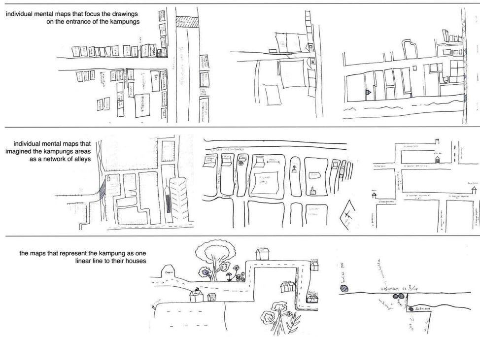
Fig.5. The Kampung's maps drawn by the young adults

Mental maps drawn by the participants in this research are varying in terms of drawing skills, scales and extend or range of the maps. Individual maps that are produced in this work could be categorised into three groups particularly according to their drawing ranges. The groups are: mental maps that focused on the entrance of his/her kampung only; mental maps that focused on a broader range outside his/her kampung; and mental maps that could not be categorised in the previous two divisions (see Fig.5).