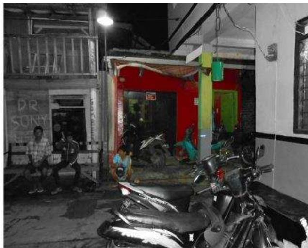
Fig.4. The favourite place to socialize in kampung Keputran Pasar Kecil (the cyber café)

In identifying favourite places in the kampung, the participants have been asked several questions related to places: What are the most important places in the kampung? What are the best places for their social activity? and What is overall the best place in the kampung?. These questions were asked in the interviews that were mostly undertaken in informal situation, ie while the participants were going about their social life in specific locations in alleys of the kampungs.