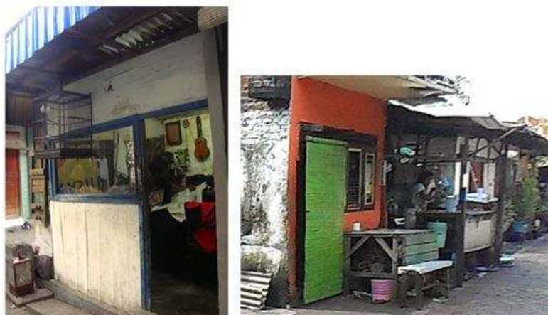
Fig.3. The favourite place to socialize in kampung Kedondong

The participants spent most of their daily time in the kampungs, whether for work or socialising and relaxing with friends. Activity patterns at the weekend show that they like to spend their free time regularly in particular places of the kampungs. Often they did also drink and gamble at nights in these places. The best time to experience the young adults' life was in the afternoon until late evening. There were no extraordinary activities in the morning, but later in the afternoon, the kampungs' main alleys became crowded. Young adults' favourite places to gather in the kampung of Kedondong were around a corner close to a barber shop, snacks/ food shop, and one-room dwellings around the corner (see Fig.3); in the kampung of Keputran, the favourite place is in front of a cyber café that is located near the entrance gate and facing the Mushalla ground (an open space). In both places, the young adults liked to spend their daily time (as in Fig.2) by socializing together and mostly continued with drinking and gambling into the evenings.