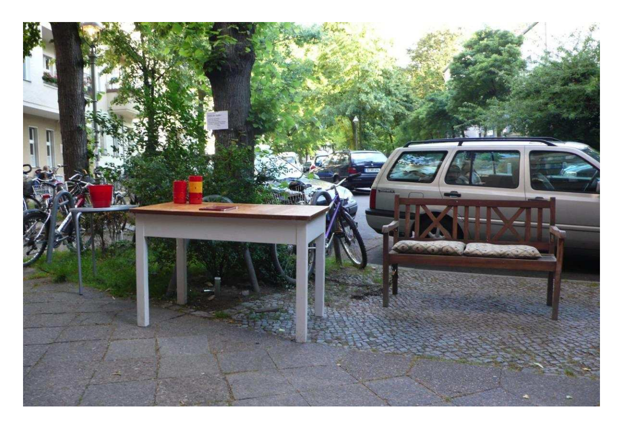
Figure 3: A restaurant appropriates public pavement space in Berlin but keeps a passageway for pedestrians open

On a larger scale, the creation of pop-up allotments was seen as a desirable part of the process of transforming the disused Berlin Tempelhof airport into a major new public open space (Figure 4). Oswalt et al. (2013) have documented similar processes in a number of European Cities.