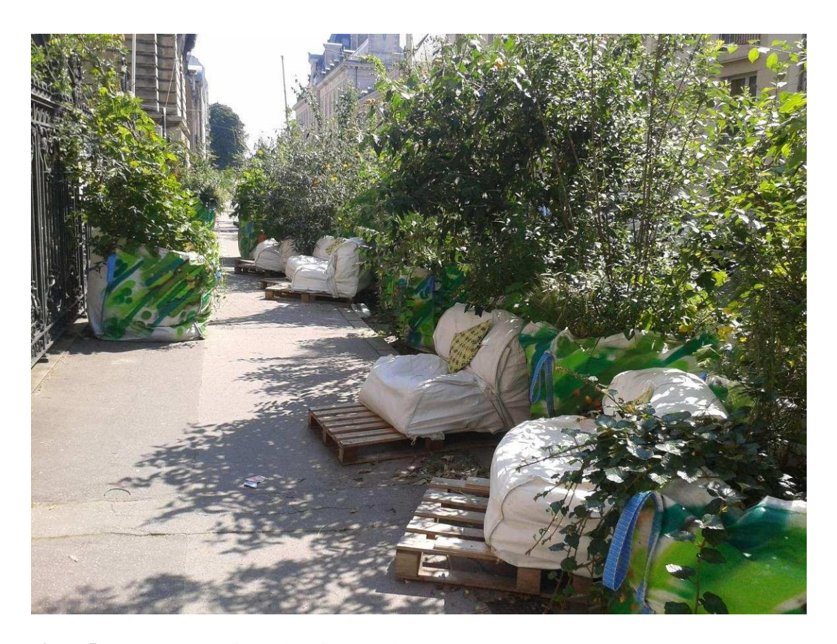
Figure 5: Temporary greening and seating areas in Nantes, France

Whilst this kind of action is focused primarily on providing social and cultural benefit it may also be interpreted as a temporary act of 'uplift' from a city marketing perspective to help to reinforce the built environment as a 'hard asset' and communicate cultural vibrancy and attractive living. In many ways this example illustrates the blurring of distinctions between the socio-cultural and economic drivers for creative action and any subsequent gains.