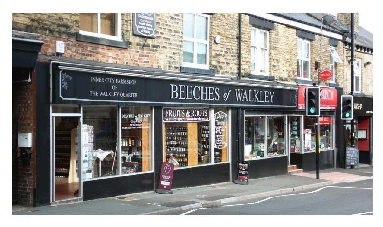
Figure 1: Beeches of Walkley and Fruits and Roots, Sheffield, UK

For the spaces that easily lend themselves to adaptation and reuse their transformation requires less invention. However, thinking of new uses for some degraded spaces can be more challenging. These include abandoned or derelict spaces which provide less obvious financial gain to the entrepreneurial investor as is commonplace amongst post-industrial 'shrinking cities'.