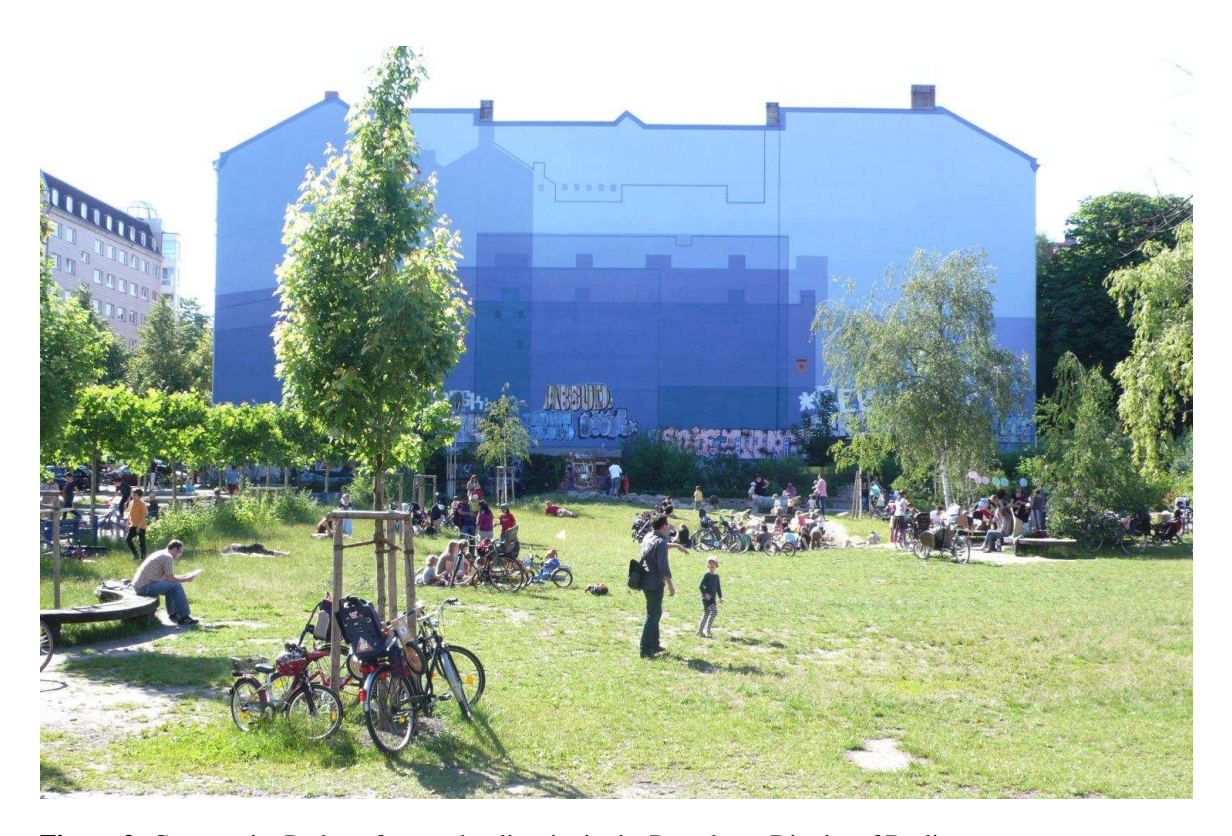
Figure 2: Community Park on former derelict site in the Prenzlauer District of Berlin

River Spree, to the development of a new park on a derelict site in the Prenzlauer district of former East Berlin (Figure 2) (SSB, 2007).