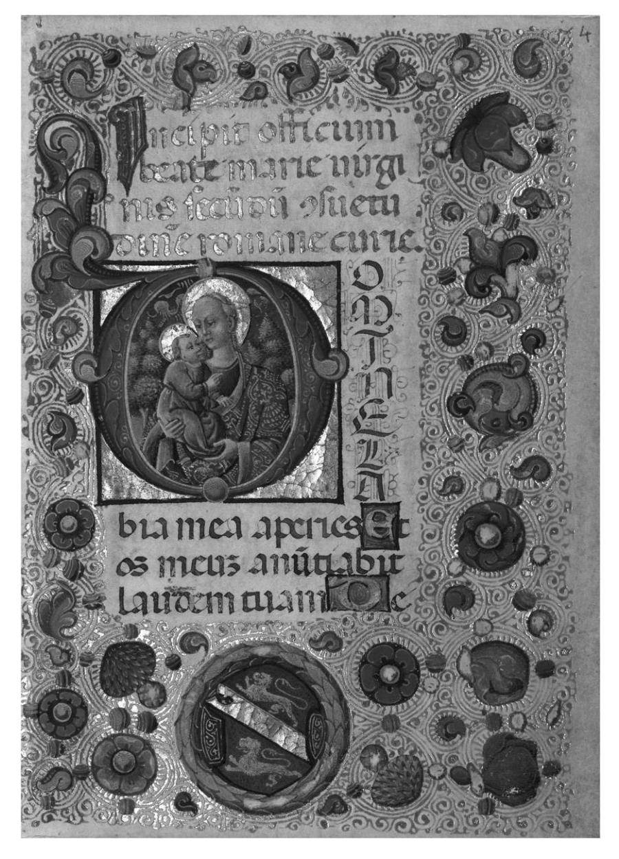
Figure 2. Guglielmo Giraldi. Initial D with the Madonna and Child, ca. 1469. J. Paul Getty Museum, MS Ludwig IX 13, fol. 4<sup>r</sup>.