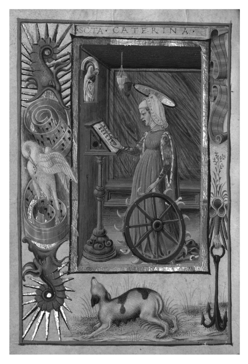
Figure 3. Taddeo Crivelli. Saint Catherine of Alexandria, ca. 1469. J. Paul Getty Museum, MS Ludwig IX 13, fol. 187<sup>v</sup>.

wheel, the only indication of her grizzly martyrdom. In the margin beneath the miniature is a dog, symbol of good faith and constancy, the praiseworthy qualities demonstrated by Saint Catherine during her encounter with the Emperor Maxentius (r. 306–12). The dog, conspicuously depicted as female,