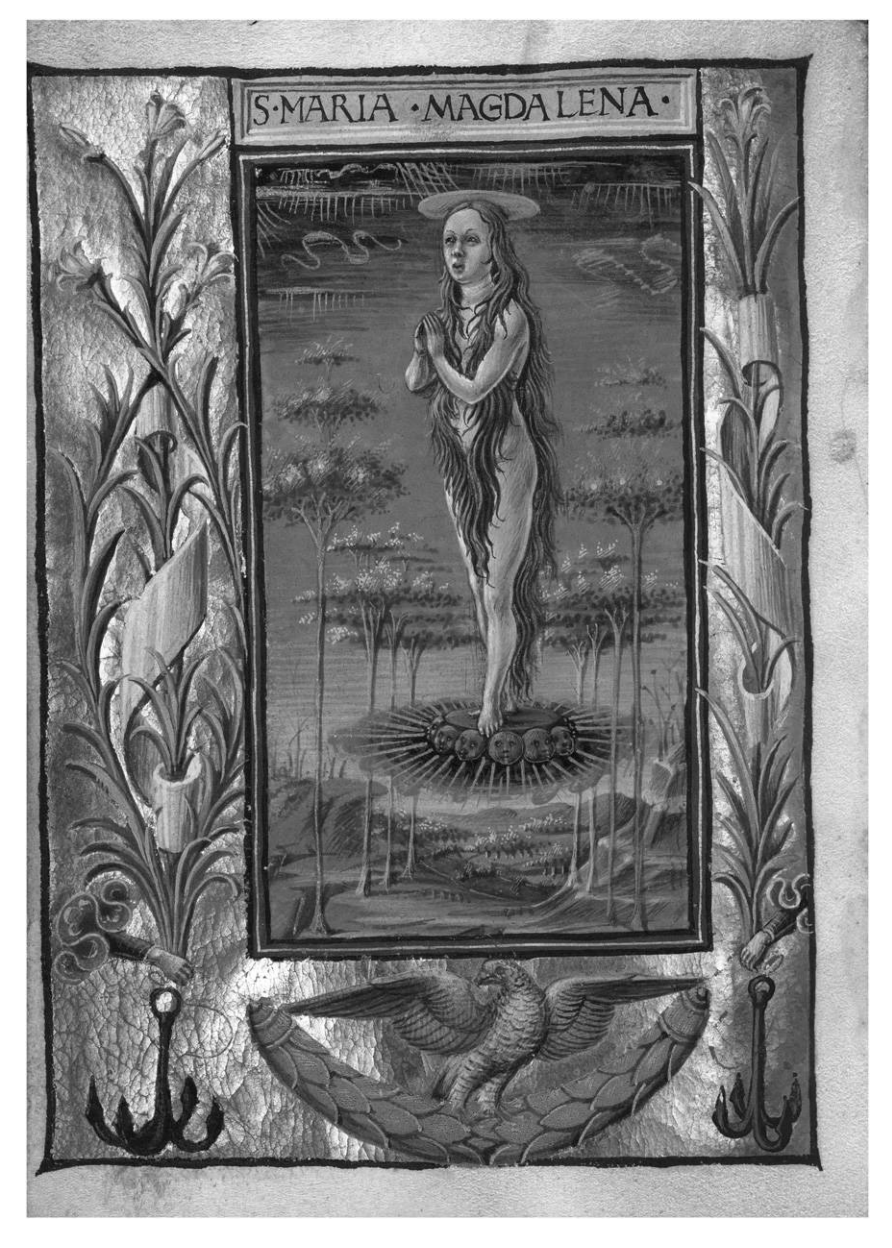
Figure 5. Taddeo Crivelli. Saint Mary Magdalene, ca. 1469. J. Paul Getty Museum, MS Ludwig IX 13, fol. 190^{v} .

celebrated by singing angels and that the psalm they are about to recite is a song. However, it does not require the reader to utter a melody; rather, it prompts them to sing in the heart, a practice that will draw them closer to the divine. The Saint Catherine page presents an example of good devotional practice in which reference