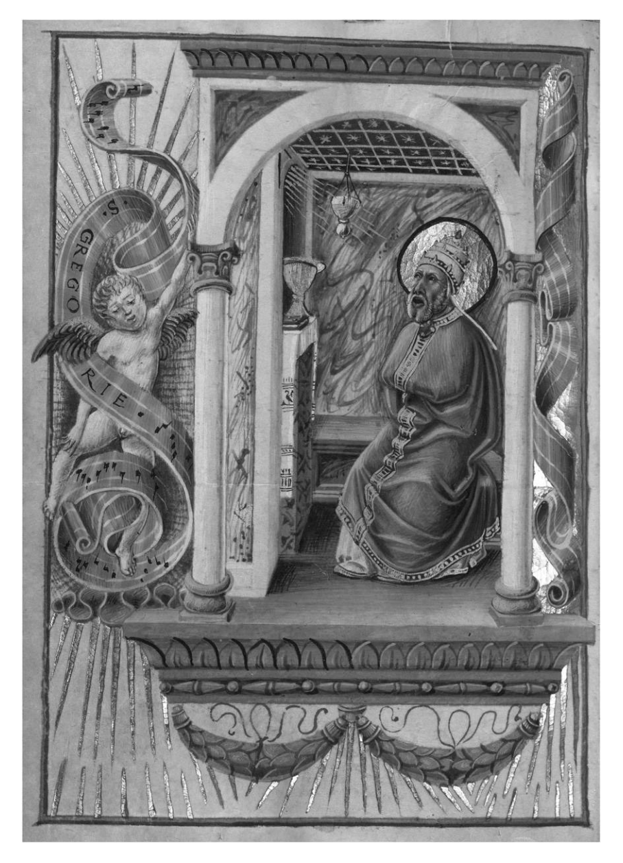
Figure 6. Taddeo Crivelli. Saint Gregory the Great, ca. 1469. J. Paul Getty Museum, MS Ludwig IX 13, fol. 172<sup>v</sup>.

song and his gaze lifted to the heavens whence emanates a golden radiance. In the lefthand margin, an angel bursts forth in a blaze of heavenly light on a blue cloud, bearing a swirling scroll of music on which is inscribed "S. GREGORIE."