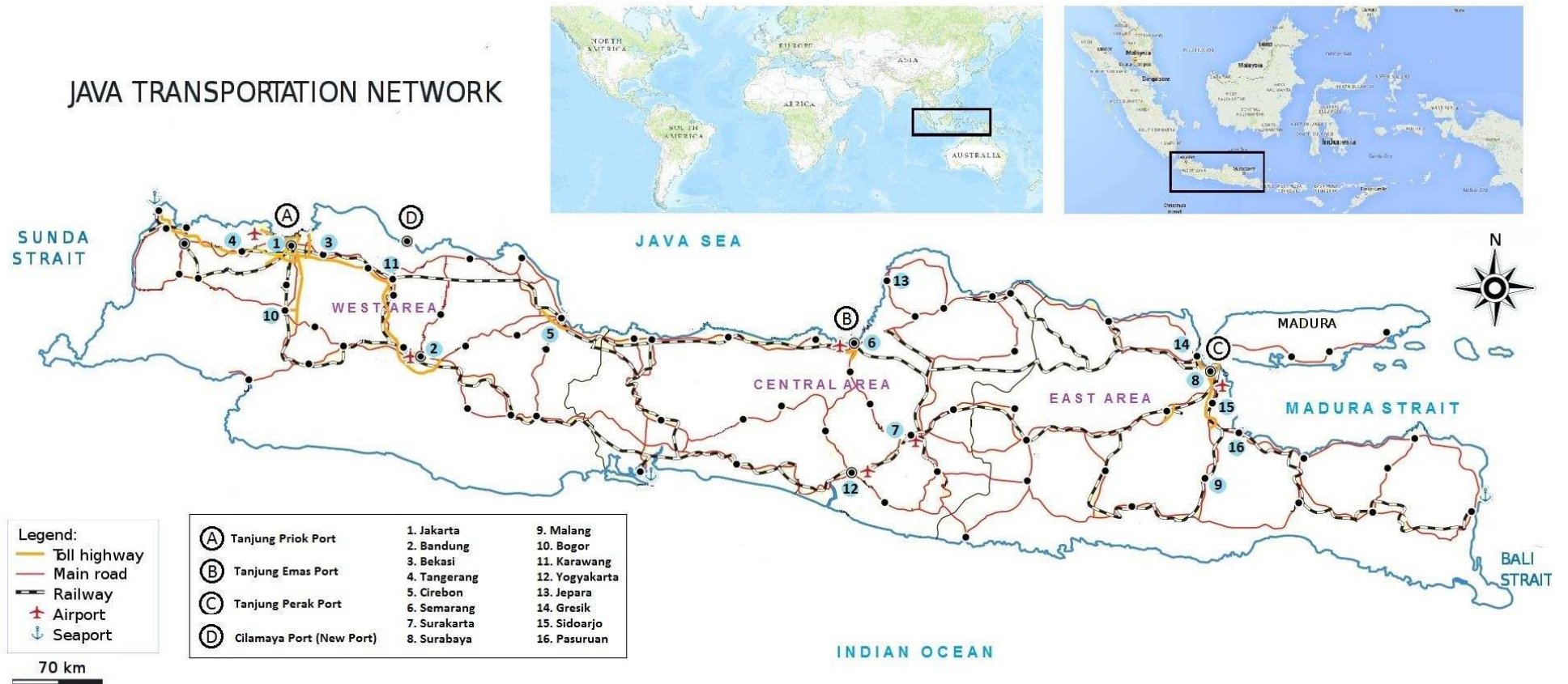
Figure 1: Map of Java and the locations of the origins and the existing and proposed ports.