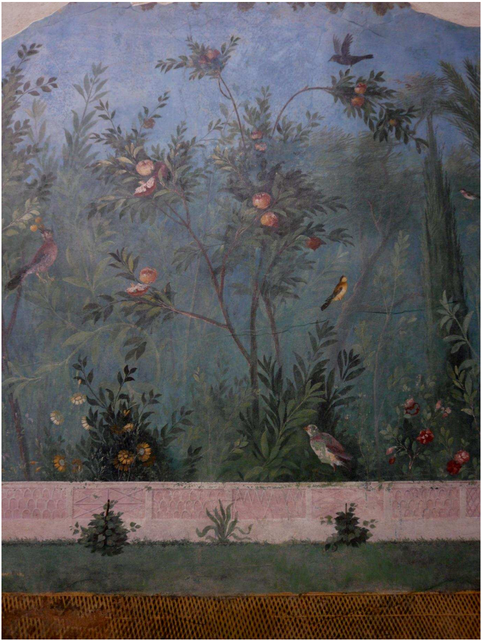
Fig. 5 Garden painting in the Villa of Livia at Prima Porta.