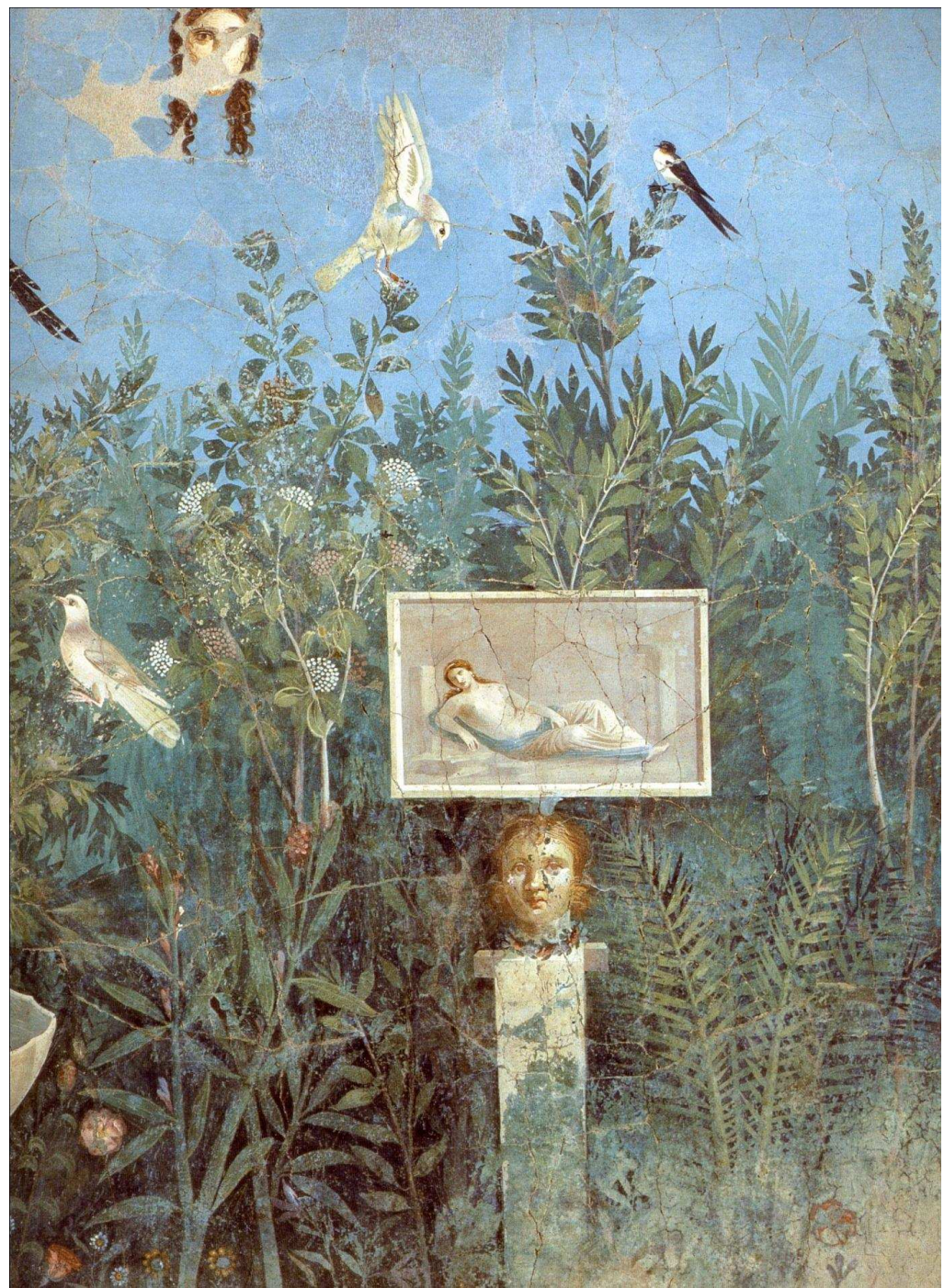
Fig. 6 Garden painting in one of the dining rooms in the Casa del Bracciale D'Oro (VI.17.2) at Pompeii.