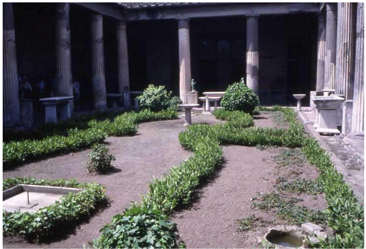
Fig. 2 Peristyle garden in the Casa dei Vettii (VI. 15.1) in Pompeii.

Fig. 1 Plan of the garden level and adjacent dining rooms in the Casa del Bracciale d'Oro (VI.17.2) in Pompeii. The black holes represent root cavities, the grey areas are configurations of plants. Drawing J. Willmott.