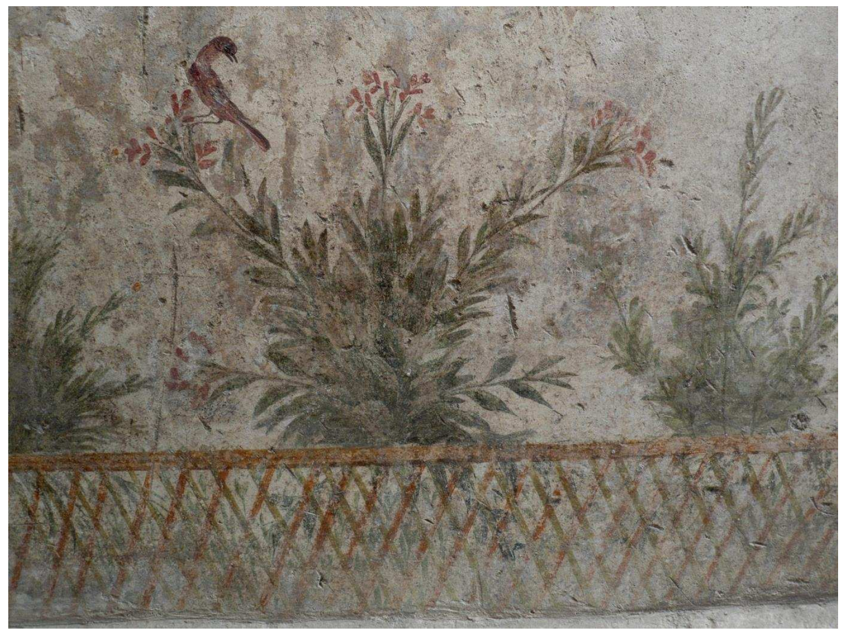
Fig. 8 Painting of garden plants and birds behind a trellis fence in a corridor leading to the swimming pool garden in the villa of Poppaea at Oplontis.