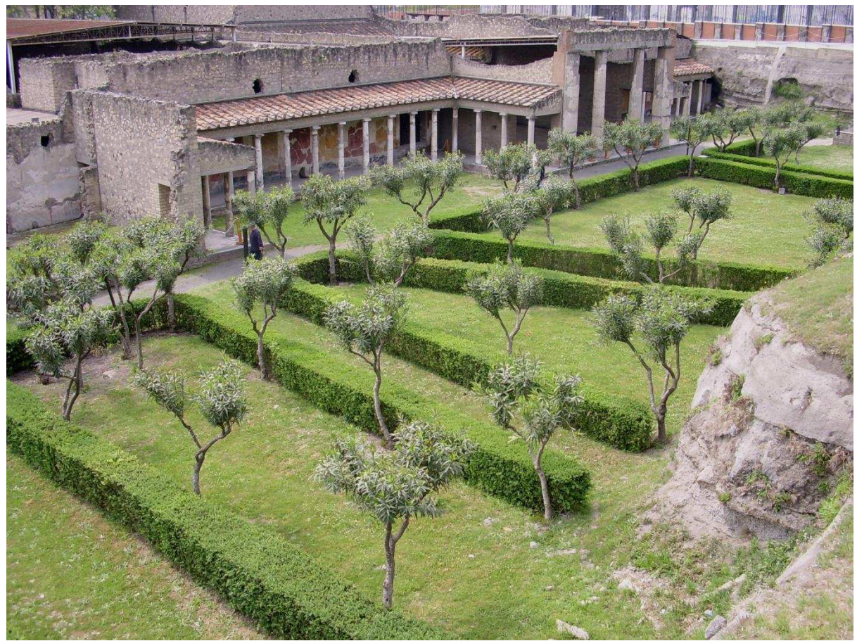
Fig. 3 The north park of the Villa of Poppaea at Oplontis, replanted after Jashemski's excavations.