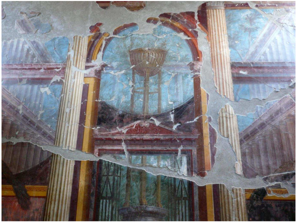
Fig. 9 Wall painting depicting a sanctuary and grove of Apollo in the Villa of Poppaea at Oplontis. Photo author.