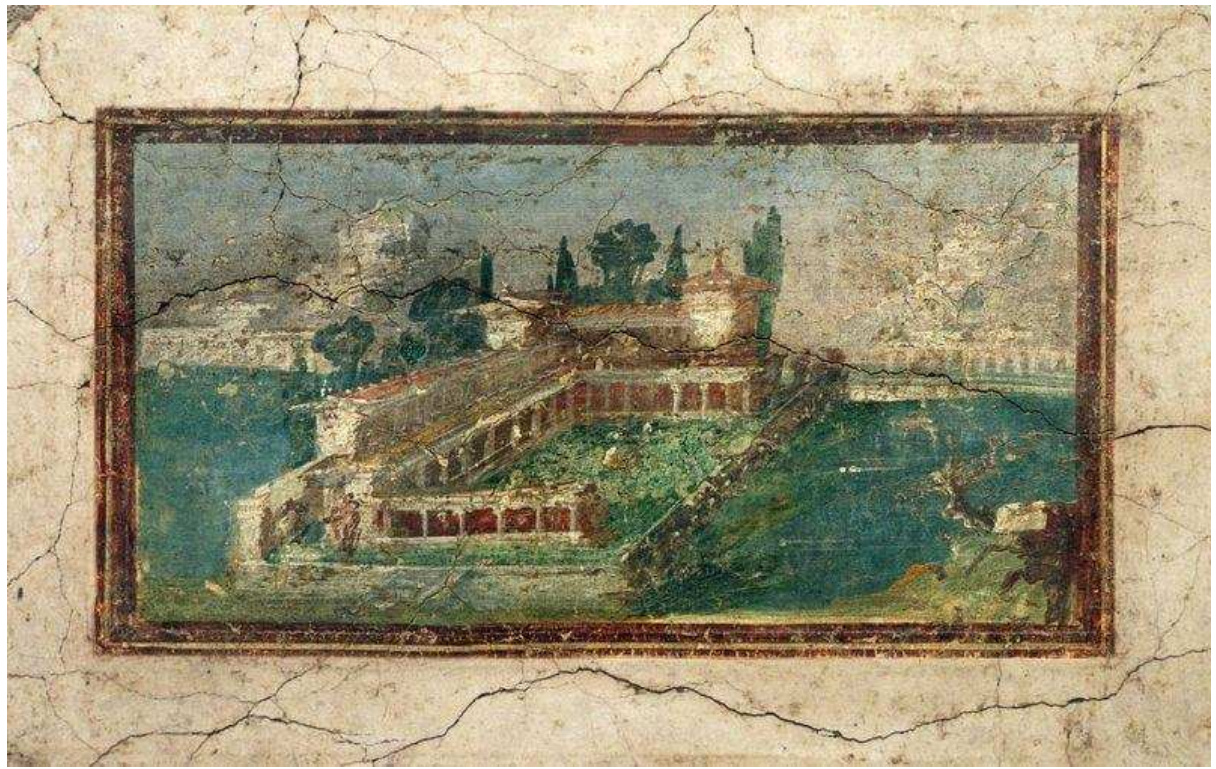
Fig. 10 Painted villa landscape from the Villa San Marco at Stabiae.