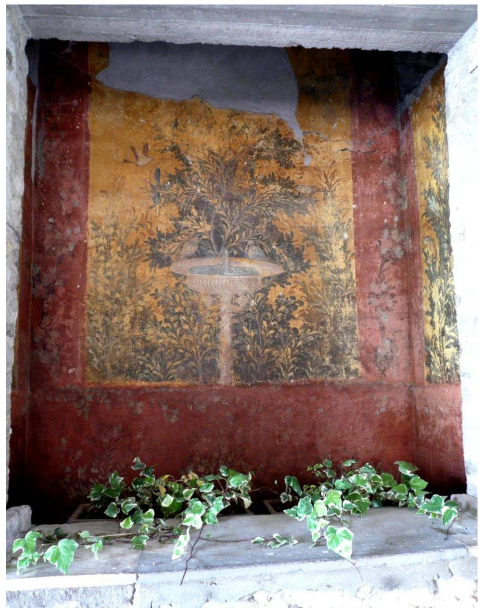
Fig. 4 Garden painting from a suite of rooms in the east wing of the Villa of Poppaea at Oplontis.