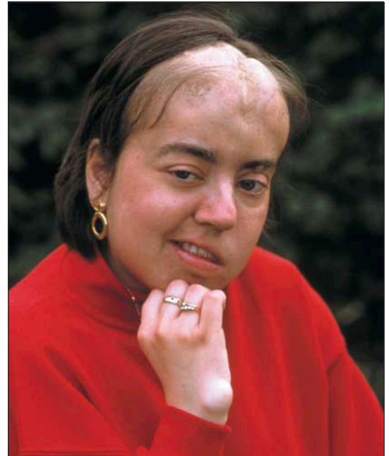
Special status for drugs for rare diseases such as neurofibromatosis may be unsustainable

Several jurisdictions have established regulations for orphan drugs. The United States was the first to do so, through the 1983 US Orphan Drugs Act. 6 The European Union did not establish orphan drugs status