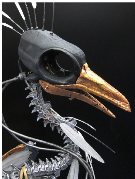
Fig. 5 Detail of the bird's head