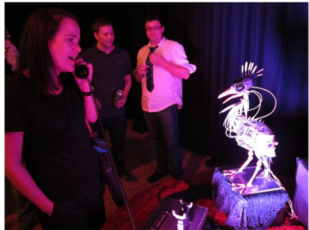
Fig. 7 Visitor has a phone conversation at JAM46 (an art and performance event)

We chose to implement an interaction scheme for the installation via an interface styled as a vintage telephone receiver, using the affordances of the telephone receiver device to facilitate an asymmetrically structured interaction paradigm. When a participant lifted the telephone receiver she/he could enter into a conversation with the bird through the telephone mouthpiece (see Figs. 7, 8). The affordance