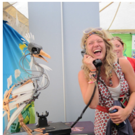
Fig. 8 Visitor has a phone conversation at the Bestival festival

of the telephone receiver enabled the participant to speak quietly if she/he so wished, out of earshot of the crowd. The bird’s responses were transmitted as recognizable English through the earpiece of the phone, forming a private channel of content available only to the participant directly interacting via the telephone.