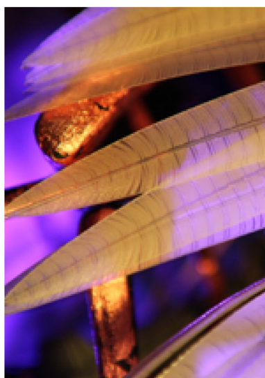
Fig. 6 Detail of the bird's feathers