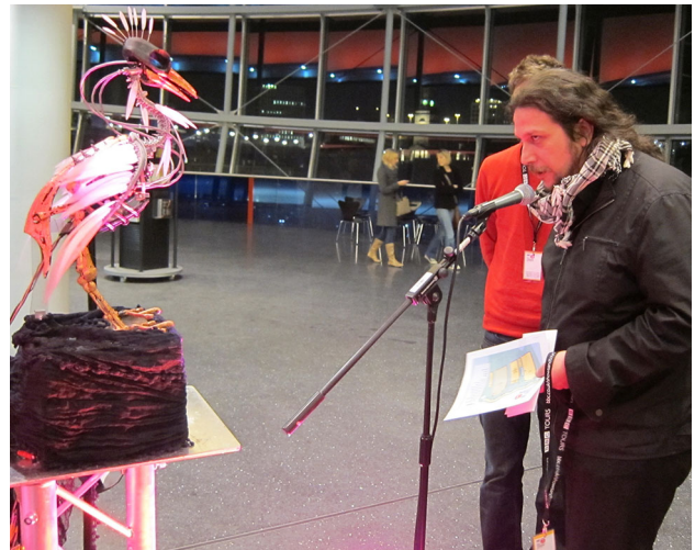
Fig. 10 Participants at the BBC Free Thinking Festival sing to the bird

predictable timing of the bird's behaviour would focus participants on testing how they could control the range and extent of the bird's vocal mechanism, tempting them to "perform" through the bird character. Allowing participants to directly control the audible content of the bird's mimicking reply meant that they could feel confident that they could predict what was going to happen after they spoke or sang. As described later in this document, exploitation of this knowledge led to participants' ability to develop more sophisticated musical constructs in collaboration with the bird character.