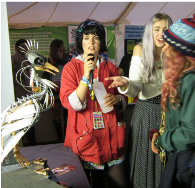
Fig. 9 Participants at Bestival sing to the bird using the microphone interface

In this interaction paradigm, the private channel of communication was removed and all efforts focused upon encouraging participants to publicly perform with the bird by making him respond to and imitate their voices. In this implementation, we chose to simplify the bird's behaviour greatly, making him purely a mimic. When a participant spoke or sang a phrase into the microphone, the bird would respond (after a short fixed interval of roughly half a second) with a stylized "birdsong" echo of the participant's utterance. We hoped that the repetitive nature and