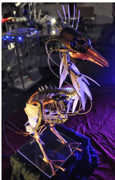
Fig. 1 Bird animatronic