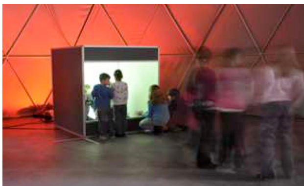
Figure 2. Participants and performers are observed by onlooking bystanders

During the course of a performance, individuals may transition between or even simultaneously fulfill these roles. There is a mutual relationship between taking an action, and observing the actions of others, hence even a performer shares a similarity to a spectator.