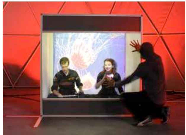
Figure 1. humanaquarium .

Permission to make digital or hard copies of all or part of this work for personal or classroom use is granted without fee provided that copies are not made or distributed for profit or commercial advantage and that copies bear this notice and the full citation on the first page. To copy otherwise, or republish, to post on servers or to redistribute to lists, requires prior specific permission and/or a fee. NIME2010, 15-18 June 2010, Sydney, Australia Copyright remains with the author(s).