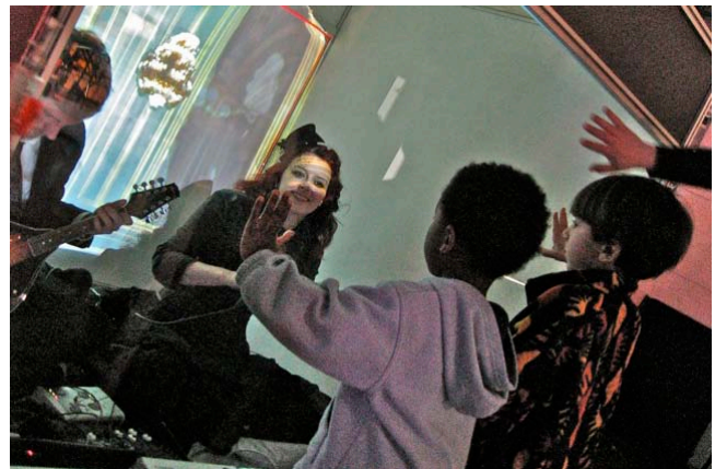
Figure 2. Participants interact with humanaquarium

humanaquarium performances range from ten to thirty minutes, the length being largely determined by the siting of the interface and presence of passersby. During each performance, members of the audience may at any time take an active part in the performance by moving their hands across the window (see Figure 2) as the musicians play. The performance trajectory varies according to the interactions of passersby, with the musicians controlling the instruments available to participants and, in effect, 'jamming' with them. Performances end either when participants lose interest and move away or, more frequently, when the musicians decide that the piece has reached a natural end because the emergent structure of the performance suggests a finale.