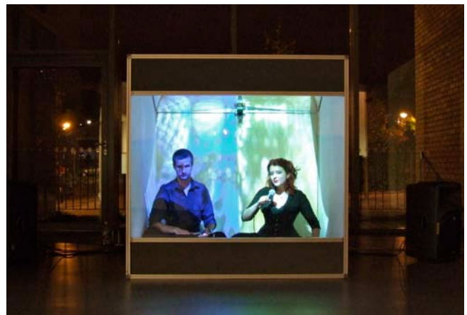
Figure 1. The humanaquarium performance

The three researchers who comprise our production and performance team each bring to the project diverse backgrounds, with professional experience from the fields of fine art, music, computer science, interface design and curatorial practice.