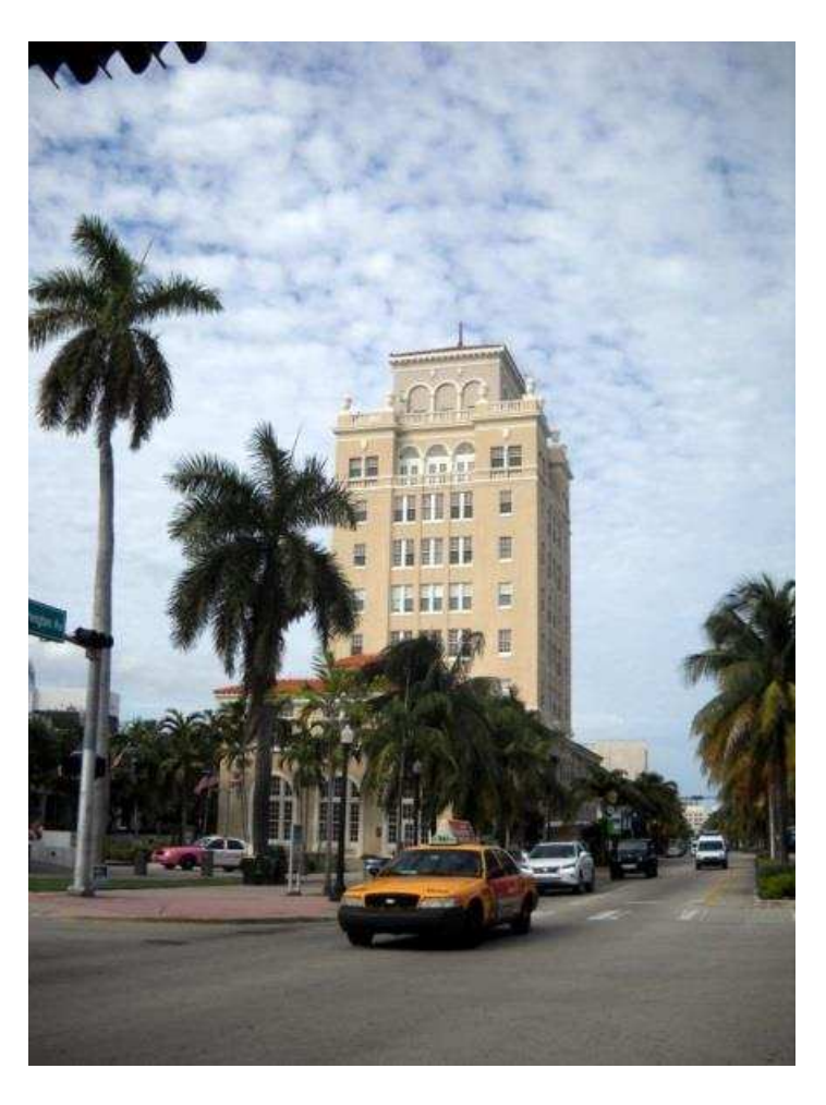
The Old City Hall Building containing the Miami Beach LGBT Visitor Center