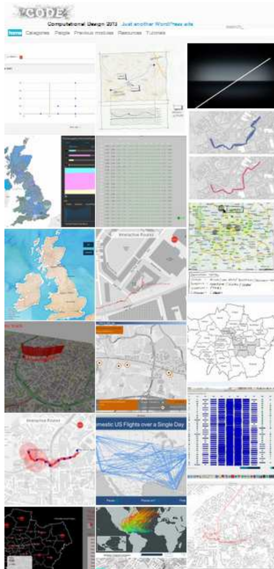
Figure 5: Superstudio blog visual interface showing an array of thumbnails, each of which links to a blog post.