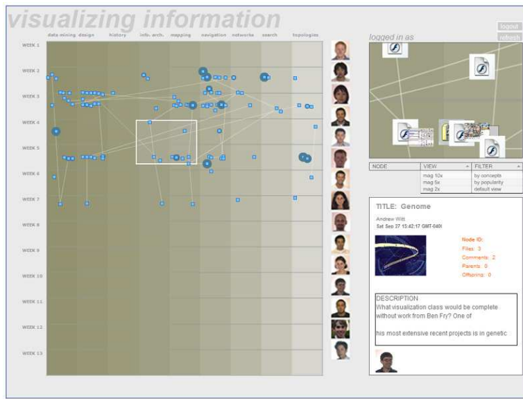
Figure 2: The OpenD visual browser of student work during the semester, arranged chronologically (y-axis) and according to themes (x-axis).

There are three basic visualization options in OpenD: nodes organized by time (chronological genealogy of ideas), by people (who contributed what), and by keywords (as specified by contributors)[21]. The time organization provides a chronology of the emerging knowledge repository; the people view is a graphic representation that clearly identifies the contributions of each individual; and the keywords organization structures the knowledge base according to topics specified by contributors. At any stage in the design process it is evident from the visualization who has contributed what to a given design output, and which ideas have been most influential in the shared knowledge base (figure 2).