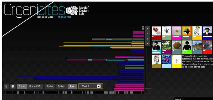
Figure 7: Visualization of the SVN file repository developed by Thomas Favre-Bulle and Simon Potier. Image: