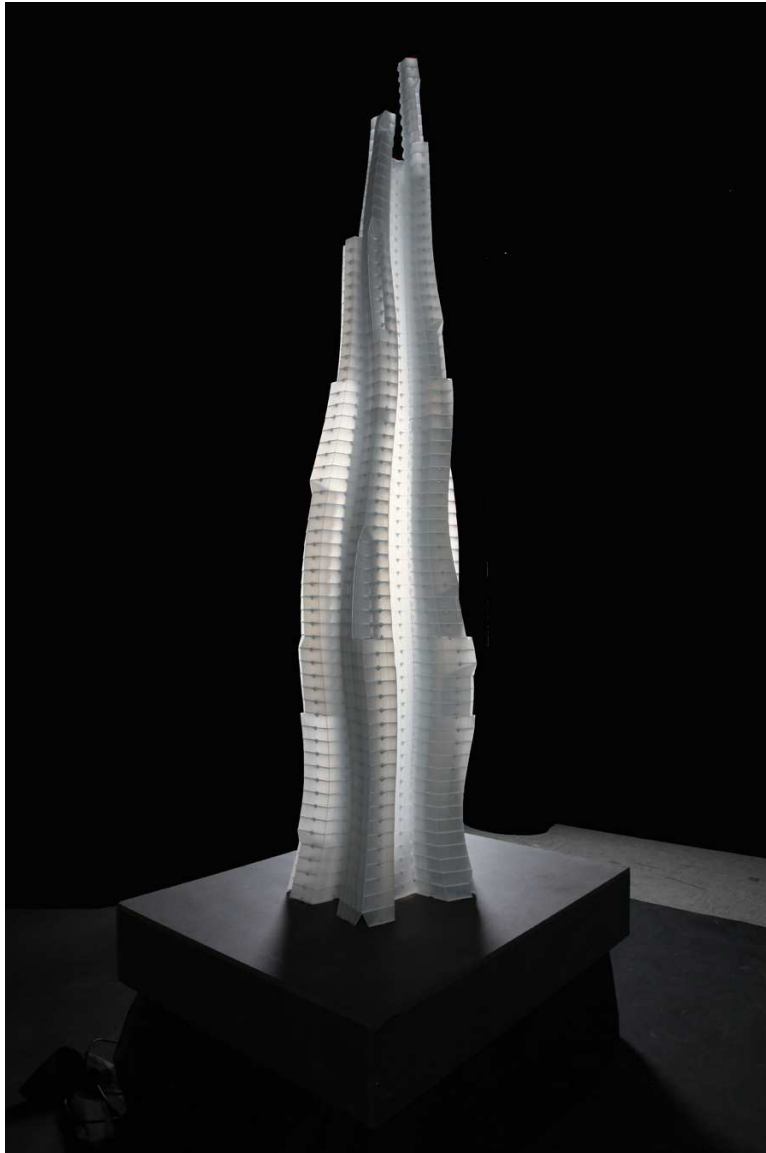
Figure 3: Skyscraper model by Osamu Moser.