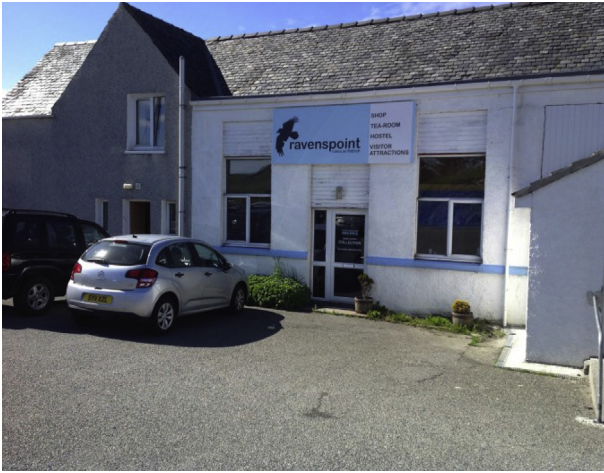
Fig. 2. Ravenspoint, Lewis.