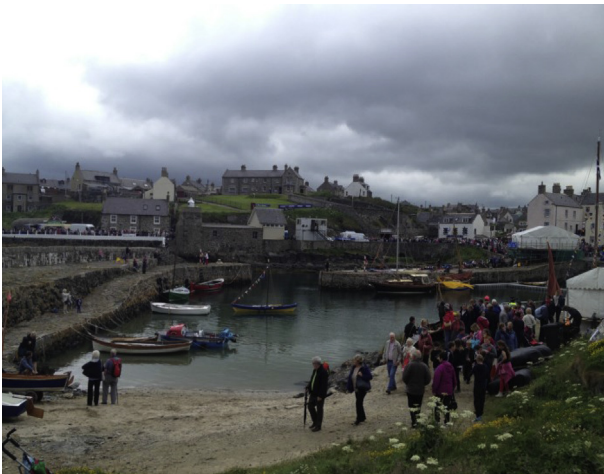
Fig. 3. Traditional Boat Festival, Portsoy.