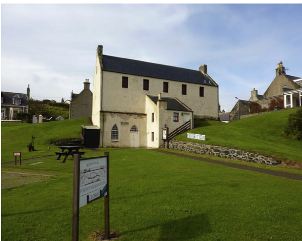
Fig. 4. Portsoy Salmon Bothy.

the Traditional Boat Festival and continues to thrive due to the role volunteers' play in sustaining it as a community enterprise: