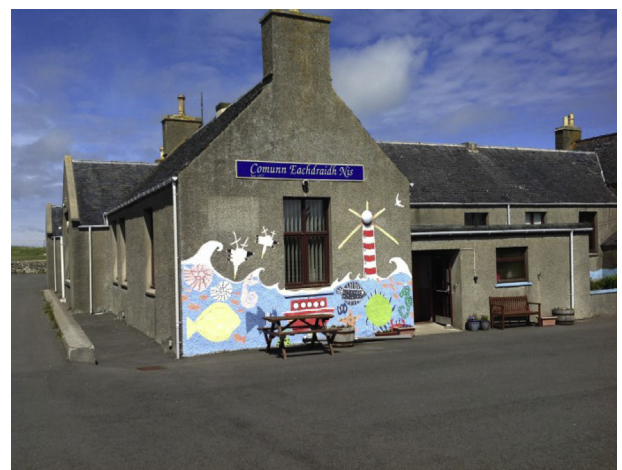
Fig. 1. CE Nis (Ness), Lewis.

Portsoy is a small fishing town that has a harbour that dates to the late seventeenth century. The Portsoy Salmon Bothy developed from the success of the community organised Scottish Traditional Boat Festival (see Fig. 3), which began in 1993 to celebrate the harbour's tercentenary. The hosting of the festival, which originally had its focus upon small Scottish traditional sailing boats, was initially highly successful, and so became a yearly event that grew in popularity due to community and volunteer efforts. The festival developed to integrate other cultural aspects into its remit as it grew, including music, food and craft. This success led to the development of the Salmon Bothy. Once an ice house (Fig. 4) for the Salmon fishing industry (that ended in 1993), it was refurbished and re-opened in 2011 due to volunteers securing funding for its restoration. The Bothy is a museum, community space and office for