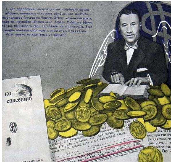
Fig. 2. V mire koshmara:

Dokumental'nyi fotooчерk o sektantakh-piatidesiatnikakh (Moscow, 1962).