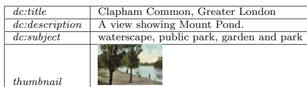
Table 1 Example Europeana item demonstrating the kind and amount of meta-data available to the hierarchy algorithms. The thumbnail image was shown to the users in the evaluation, but is not used by any of the hierarchy algorithms.

We make use of three pieces of information from the Europeana metadata (see Table 1 for an example). The dc:title , dc:description and dc:subject fields that contain textual information describing each item. These fields were chosen since they are more informative than other fields in the meta-data and also tend to have been completed more consistently than other fields by the institutions that provide information to Europeana. 99% of records have a dc:title , 74% a dc:description , and 64% at least one dc:subject value. The dc:title and dc:description provide short pieces of textual information about the item. The dc:subject field often links the item to an existing hierarchy, but not all providers have done this (i.e. the information is incomplete) and providers have also used a wide range of different hierarchies without documenting which one was used. For evaluation purposes, but not in the hierarchy creation process, we also used the thumbnail images provided by Europeana.