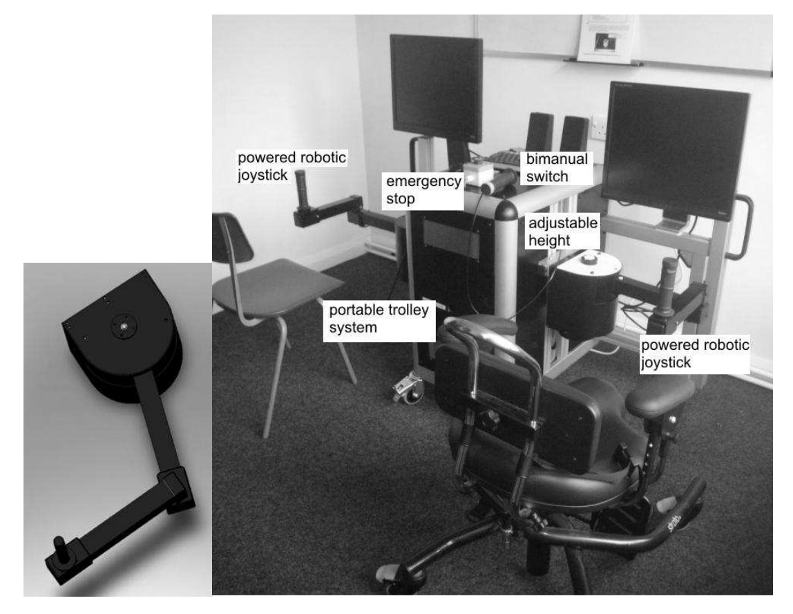
Figure 1. The Computer Assisted Arm Rehabilitation (CAAR) games system. Two adjustable height powered robotic joysticks and associated hardware are housed in a portable trolley system. The bi-manual switch and emergency stop are illustrated.