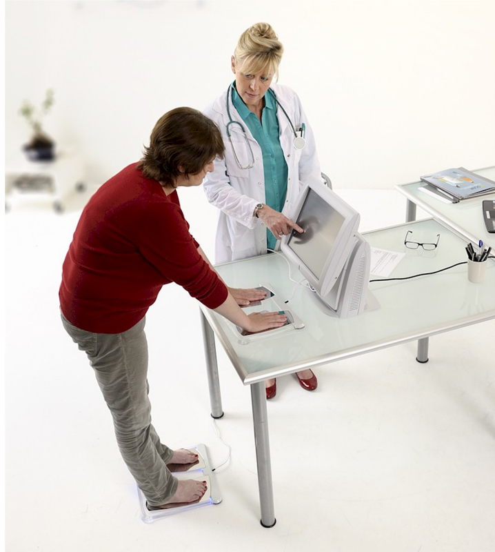
Fig 1. SUDOSCAN.