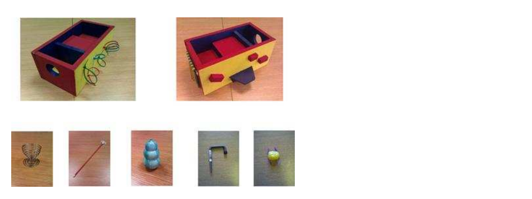
Fig. 1. The Unusual Box, and the Five Novel Objects

test was developed to measure DT in 2-year-olds. The Unusual Box Test (UBT) involves children playing with a colorful box with strings, hoops, stairs, ledges, etc., alongside 5 novel objects (see Figure 1) (Bijvoet-van den Berg & Hoicka, 2014). DT is determined by the number of different action/box area combinations children generate (see Methods). This test shows good test-retest reliability in 2-year-olds, and good validity in 3- and 4-year-olds when compared to the Wallach and Kogan test (1965), and the Thinking Creatively in Action and Movement (Torrance, 1981), another DT test that cannot be used with children under 3 years.