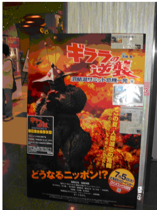
Guilala Strikes Back!

It's not often you hear or read this combination of words in the same sentence but surely this year's summit meeting of the Group of 8 (G8) leaders will be etched on people's memories for generations to come. Nobody could have predicted the cataclysmic events that unfolded on the northernmost island of Japan in the summer of 2008: the city of Sapporo attacked by the vengeful space monster Guilala; the leaders of the G8 countries united in their efforts to destroy the creature; former Prime Minister Koizumi Junichiro ended recent speculation and returned to take over the reigns of power in a time of crises; and the G8 leaders taken hostage by Kim Jong-Il. For an annual diplomatic event that is often portrayed as little more than a meaningless ceremony, this has to have been one of the most unforgettable summits in its thirty-three history. At least that's what happened if you only watched the highly amusing monster movie Girara no GyakushÅ«: Toyako Samitto Kiki Ippatsu (Guilala Strikes Back: Crisis at the Lake Toya Summit) premiered in Hokkaido the weekend before the G8 summit began.