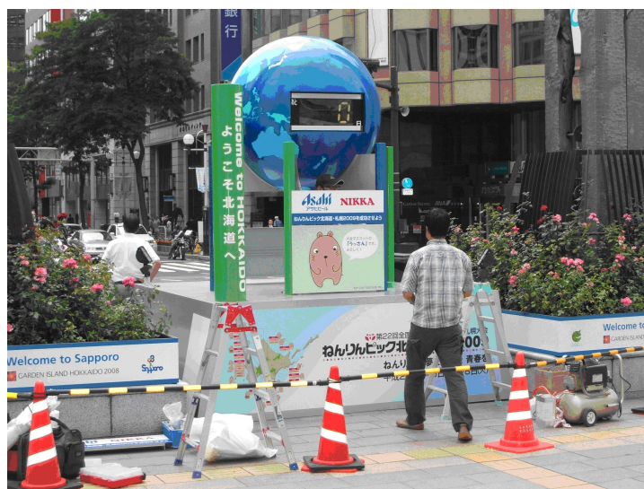
The Party's Over for Another Year

The most commonly asked question immediately after the summit was whether it had been a success or a failure. However, this question is symptomatic of a popular attitude to the summit that demands quick fixes. The nature of the G8 demands that a few years pass before the question can be revisited in a meaningful way and in the meantime various international NGOs and the G8 Research Centre at the University of Toronto will continue to track compliance and seek to hold the G8 leaders accountable for the fulfilment of their promises. The best that can be said at this stage is that the results were mixed. Toyako was not as successful as some summits (Rambouillet in 1975 or Bonn in 1978 for example) and not as disastrous as others (San Juan in 1976 or Bonn in 1985). Japan will continue to act as chair of the G8 until Italy takes over at the beginning of 2009 and already there have been a series of incremental follow-ups that continue the G8 process but will probably get little media attention: the framework for action on global health, regular finance ministers' meetings, foreign and finance ministers' statements, and the G8 parliamentarians meeting in Hiroshima.