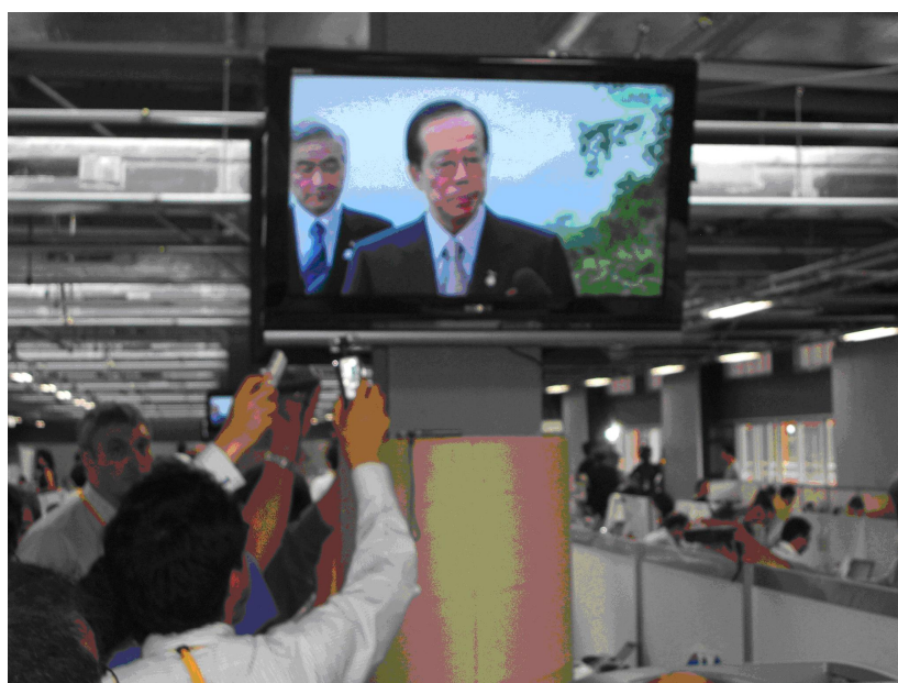
Hanging on Fukuda's Every Word

Regardless of whether this was Fukuda's strategy or not, the summit predictably appeared to have little effect on an already deeply unpopular leader. According to an opinion poll conducted by the Asahi Shinbun immediately after the summit and published on 15 July, Fukuda's cabinet commanded an approval rating of 24 per cent, an increase of 1 per cent from the previous month's poll, and a disapproval rating of 58 per cent, a decrease also of 1 per cent. Specifically as regards his performance at the summit, 24 per cent believed that he had demonstrated leadership, as opposed to 60 per cent who disagreed. 32 per cent of pollees rated the G8's treatment of climate change, whereas 60 per cent did not. Thus, a distinct lack of leadership was perceived and any results that may have emerged from the summit were unlikely to be credited to Fukuda. Subsequently there was a slight rise in Fukuda's approval ratings according to some polls but it occurred after the G8 summit had passed from people's memories and was likely to be a result of different factors. In any case, this did not forestall his resignation.