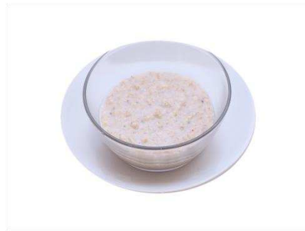
Figure 1. Image example of foods photographed on a plate (white toast) or bowl (porridge).