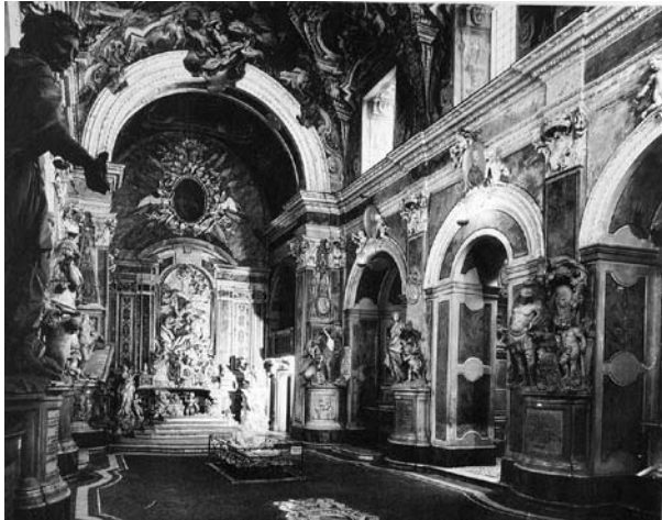
Figure 4: Cappella Sansevero de' Sangri, Naples, 1749-66.

of decadence. 22 He placed the Catholic Church at the heart of his analysis of the baroque as an artistic bruttezza , and Italy's decline ( decadenza ) from the middle of the sixteenth to the early eighteenth centuries in terms of 'entusiasmo morale' 'moral exuberance'. For him the baroque as a sort of brutto artistico was not artistic at all, but, on the contrary, something different from art, based on 'un bisogno pratico' ('a practical need'). 23 For Croce the word "baroque" specifically invokes the anima barocca , the baroque spirit, rather than particular forms – the anima barocca allows representation to become mere bravura and, unlike other ugly forms, leaves one stupefied, cold, and with a sense of emptiness. 24 This is crucial to Croce, since for him art is a liberator: 'By bringing them as objects before our minds, we detach them from ourselves and raise ourselves above them.' 25 In discussing the independence of art, Croce avers that 'that which is trivial or barren is only so insofar as it has not been raised to the level of expression; in other words, triviality and sterility always arise from the form given by aesthetic treatment, from its imperfect mastery of content, and not from the material qualities of the content itself.' 26 As for cause, the anima barocca is rooted deep in sinful human nature, but was produced by the Church, which collapsed religion into politics.