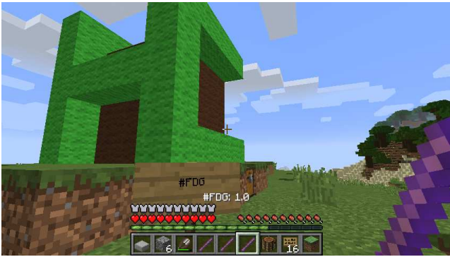
Figure 2: Diviningrod displaying the distance to a sign.