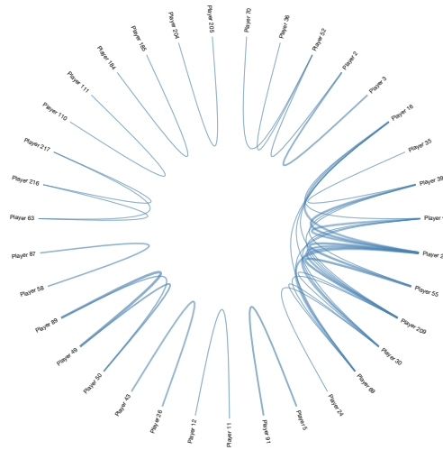
Figure 4: Players working to the same buildings. Weighted by amount of contributed blocks.