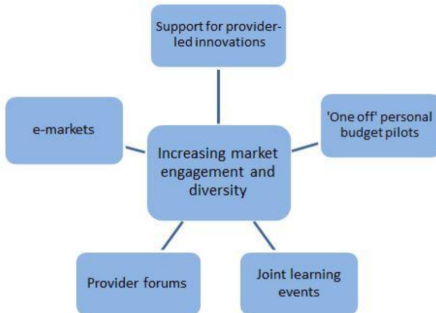
Figure 2: Examples of methods to facilitate market engagement and diversity