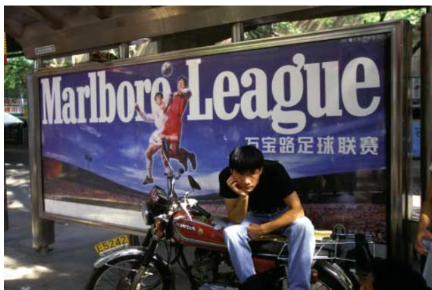
In Puerto Rico, China (above), and Venezuela, the cost of smoking has been estimated as 0.3%-0.43% of the gross domestic product

Passive smoking causes illness and premature loss of life, at all ages from the prenatal period to late adult life