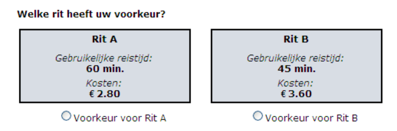
Figure 1: Example of SP question in experiment 1 for car respondents

An example of an actual screen shot of a choice situation in experiment 1 is shown, in Dutch, in Figure 1. The set-up with only two alternatives (A and B) and only two attributes (travel time and travel cost) was chosen to replicate the VOT surveys of 1988 and 1997 as much as possible (so that the outcomes can be compared over time). The statistical design used here (also see Significance et al., 2007) is the 'Bradley design', which is close to orthogonal but without creating dominant alternatives), and where all the possible alternatives occur (full design).