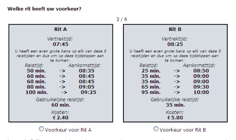
Figure 2: Example of SP question in experiment 2a for car respondents

Figure 2 provides an example of a choice situation in experiment 2a.