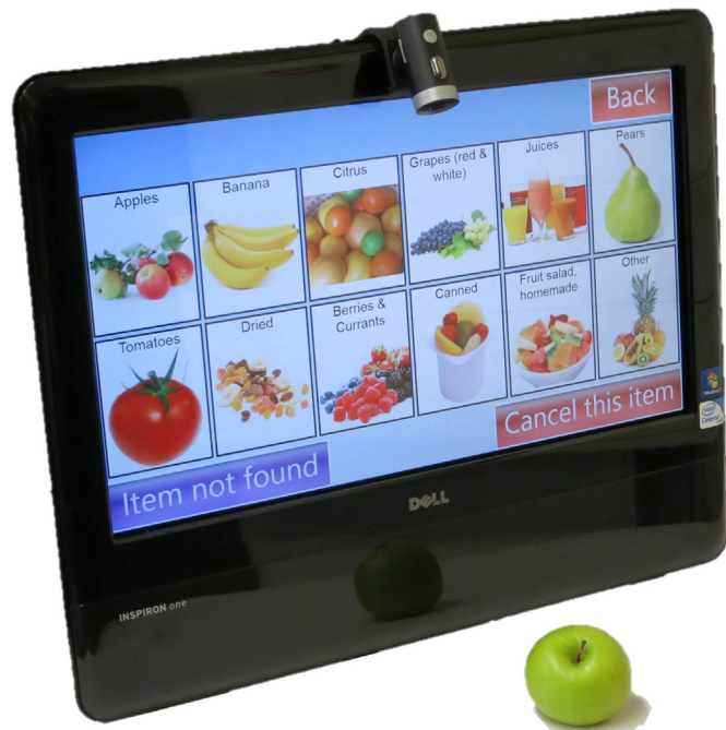
Fig. 2. NANA system showing nutrition data entry.

ageing (Deary et al., 2010) and the tasks developed for NANA were based on existing gold standard measures used in the assessment of cognitive function. The white square task was a simple measure of processing speed requiring participants to touch a white square as quickly