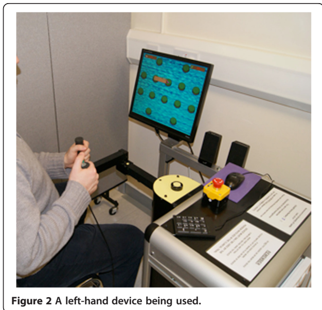
Figure 2 A left-hand device being used.

The computer program includes a base “software platform” for underlying functions and a set of activity-based tasks that was used to direct and control the exercises. The software also measures the number of hits in the assessment exercise. The assistance levels will adjust according to the performance in the assessment exercise. As the user performance increases, the assistance levels decrease by the set algorithm of the software. The computer screen provides visual and auditory feedback of the target location and the movement of the joystick. The baseline clinical examination and computer assessment exercise allows the initial exercise parameters (duration, nature of games, game levels and assistance level) to be set.