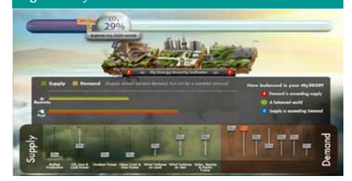
Figure 2. My2050 Scenario Tool

The final aspect of the workshops involved participants in discussion of 'scenario narratives' created specifically for this research and designed to reflect three plausible future energy system scenarios. The first narrative reflected a "do nothing" scenario and depicted continuing reliance on fossil fuels along with associated impacts relating to climate change and energy security. The second narrative involved a highly technological response to energy issues depicting use of technologies like Carbon Capture and Storage (CCS) and nuclear energy along with some renewable energy deployment and a small amount of change on the demand side. The third and final narrative centred on high levels of renewable deployment and correspondingly higher levels of change to the demand side. These were written from the perspective of the first person and were intended to generate a greater sense of the implications of energy system change for everyday life (see appendix). The narratives were developed from a range of scenario sources and from information attained through interviews with expert sources.