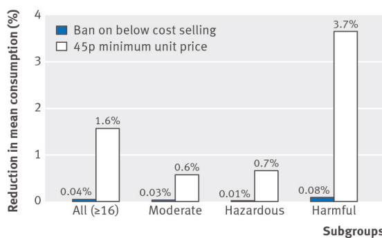
Fig 2 Modelled impact of a ban on below cost selling compared with impact of a 45p minimum unit price