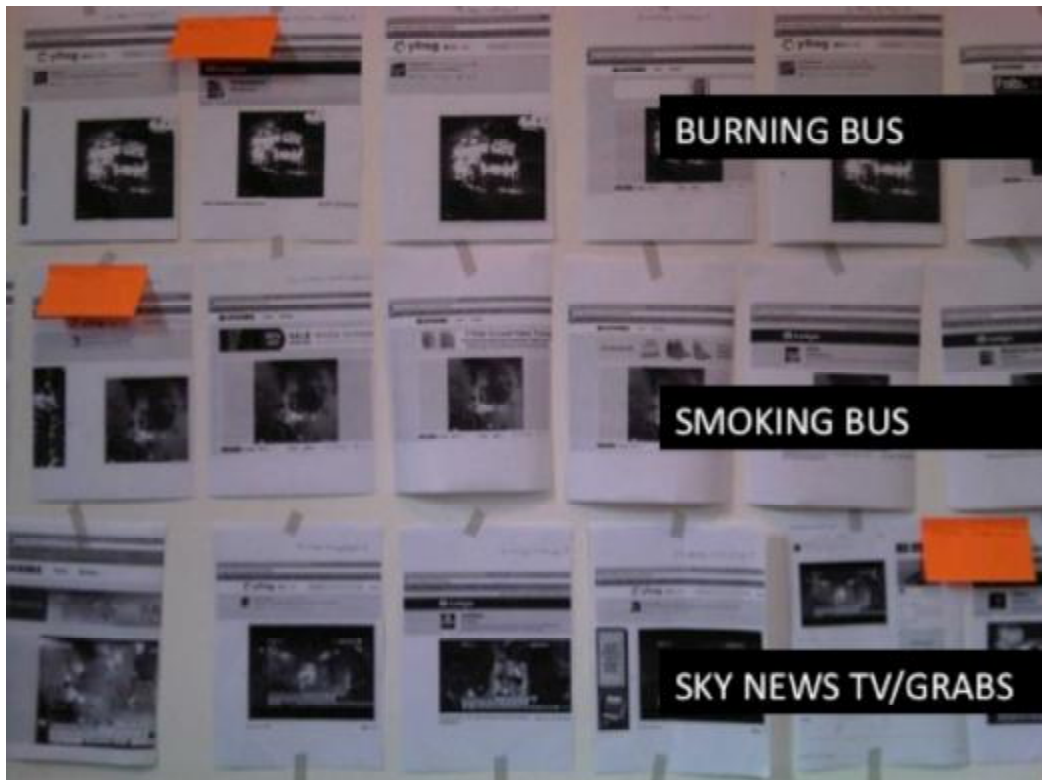
FIGURE 3 Image wall

To identify all bus images, links from the 'bus' category and those depicting the bus in TV screenshots were identified. The resulting 57 images were printed out and arranged on a wall (Figure 3) to inductively identify subcategories.