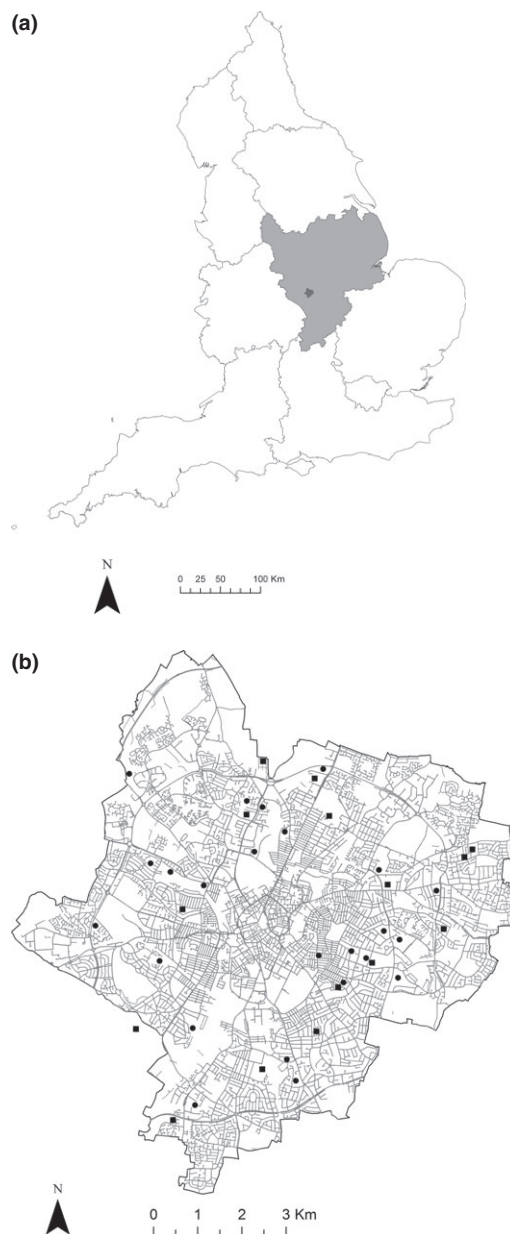
Fig. 1. (a) The geographical location of the East Midlands within England and our study city, Leicester, and (b) the position of allotments within Leicester. Square symbols represent allotment sites sampled; circular symbols are unvisited allotment sites.

Allotment provision in Leicester peaked in the 1930s, with one household in three renting a plot (Crouch & Ward 1997). Today, the city has 46 allotment sites (Fig. 1b), 45 of which are owned by Leicester City Council with 3200 individual plots (Leicester City Council 2012) that in total cover c. 2% of the city's greenspace. Within the city, greenspace constitutes 56% of the total area with 32% managed on a small scale privately in domestic gardens, and the remaining 68% is non-domestic greenspace generally managed on a large scale by Leicester City Council or large institutions.