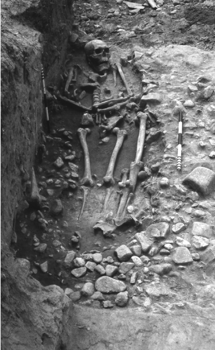
Figure 4. A Late Mesolithic inhumation burial from Schela Cladovei, Romania. Even in a period where intense conflict was known, there is no set method of burial practice, with other human bones interpreted as having been excarnated visible along the left side of the burial.