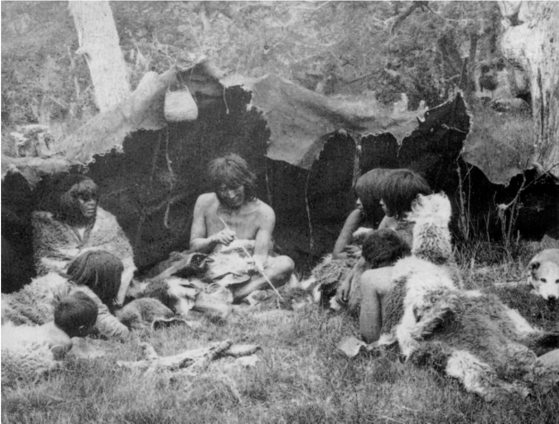
Figure 1. A group of Selk'nam watching a prestigious flint knapper making arrows