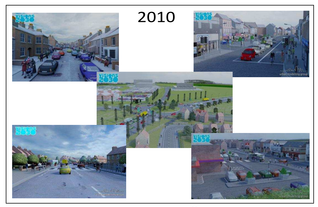
Figure 1: Street scenes in 2010

(2) The second step has been to create vision narratives which describe various aspects of society and its transport system that are consistent with the visualisations. An overview of these visions narratives is given in Table 1.