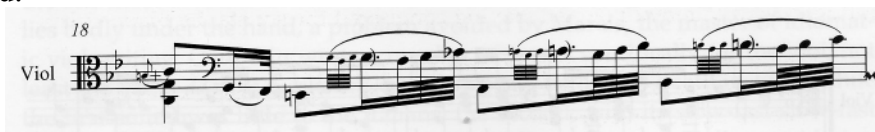
Example 4. Forqueray: La Rameau , bar 18.

Here one can see similar grand French openings, although there is already a greater leaning towards a process of modulation in the Barrière. Further on in both these movements, typical French viol figurations are used: