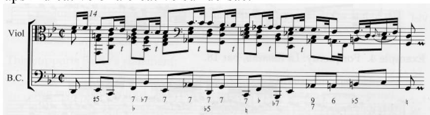
Example 1. Antoine Forqueray, La Rameau , bars 14-16.

appear (ex.1). That no other composer chose to follow Forqueray's lead is perhaps indicative of a creative cul-de-sac.