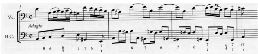
Example 6. Barrière, Adagio from Book II, Sonata I, bars 1-3.

These both exhibit the attachment to the bass line that characterises so much French viol music. However, Barrière was writing for the newer instrument and there is a marked change between the first book, still stylistically connected to