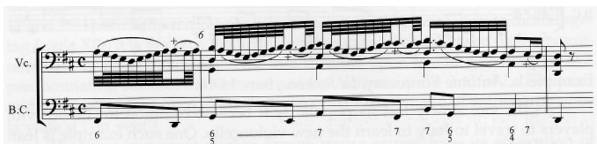
Example 5. Barrière: Adagio from Book I, Sonata I, bars 6-7.

These both exhibit the attachment to the bass line that characterises so much French viol music. However, Barrière was writing for the newer instrument and there is a marked change between the first book, still stylistically connected to