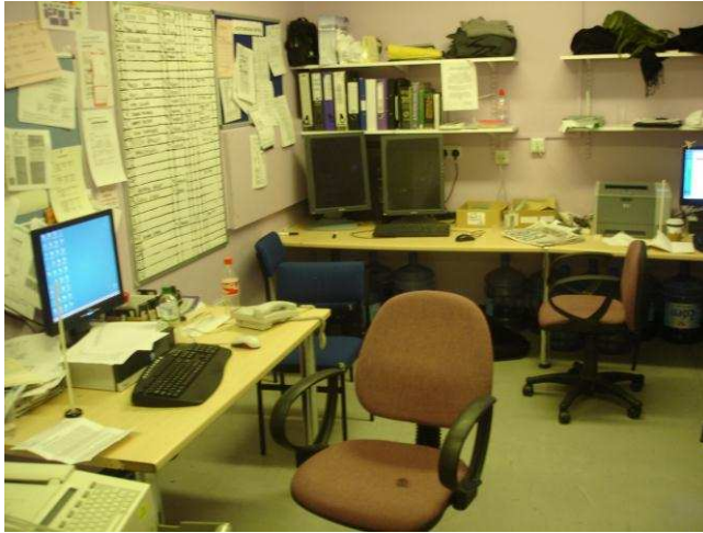
Fig. 3 The doctors' room

There are a range of clinical and non-clinical staff working on the ward: the ward medical staff (referred to as the acute medicine team), nursing staff, health care assistants (HCAs), physiotherapists, occupational therapists, pharmacists and the ward clerk. Patients are also visited by staff from teams that are not based on the ward, such as the cardiac team. There are typically three nurses and three HCAs on each shift and one charge nurse.