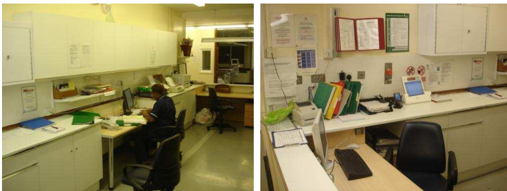
Fig. 2 The nurses' station