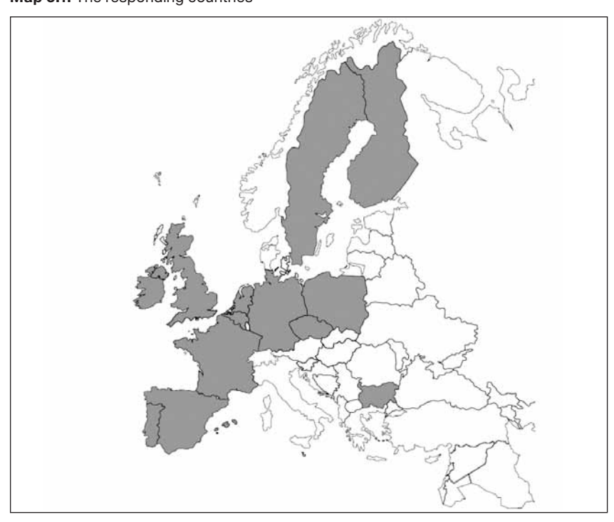
Map 3.1: The responding countries

A questionnaire was distributed to social housing experts in Belgium (Flanders), Bulgaria, the Czech Republic, Finland, France, Germany, Ireland, Netherlands, Poland, Portugal, Sweden, Spain and the UK (Map 3.1). Most of the experts were able to answer the questionnaire in English, but translation of the questionnaire and responses was undertaken where necessary. A list of the responding experts is presented in Appendix 1 .