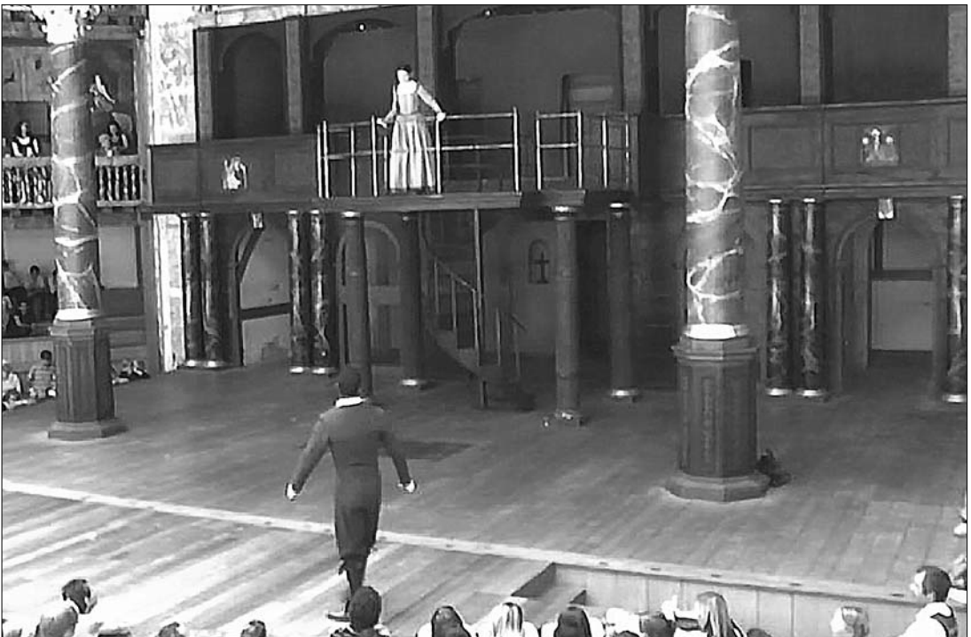
Figure 10 (below). Romeo and Juliet (dir. Dominic Dromgool, 2009).