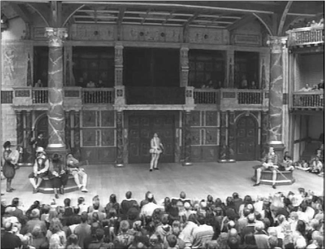
Figure 8. Romeo and Juliet (dir. Tim Carroll, 2004).

few standing members of the audience are unable to see the actor and with a bit of judicious movement, she can reach everyone.