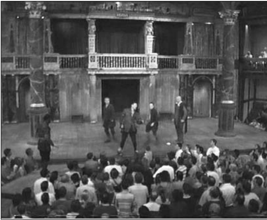
Figure 2. Coriolanus (dir. Dominic Dromgoole, 2006).

the yard, which he turned into a 'fractious public forum' in his design for Lucy Bailey's 2006 production of Titus Andronicus . 17