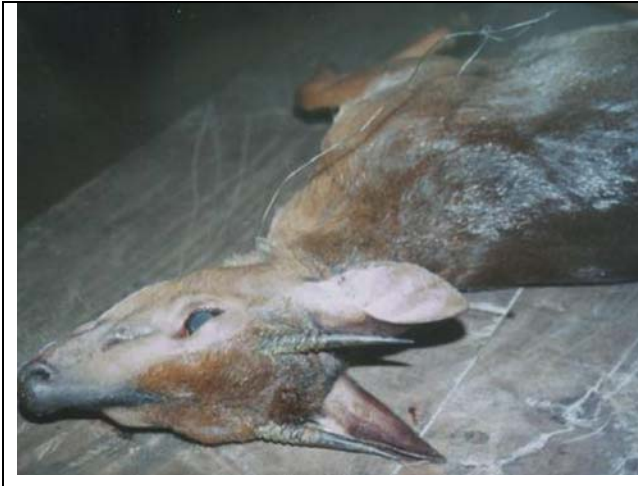
Fig. 4. Suni ( Neotragus moschatus ) caught with a cable snare. taken in one of the villages surrounding NDUFR.