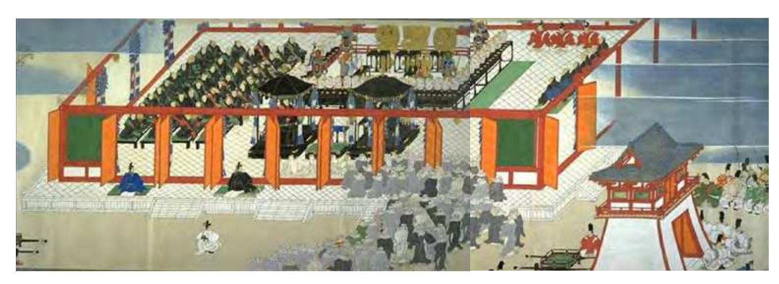
FIGURE 1. The Yuima-e's debating participants flanked by the four rows of the official audience and the imperial emissary (from the Kasuga gongen genki 春日権現験記, items 11-012 and 11-013).