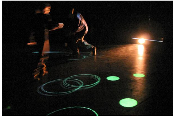
The football game being developed in rehearsal in the theatre studio.

The relatively simple programming environment enabled us to work quickly and improvise with the technology. Usually, only a few minutes were needed to alter the parameters of the sprites (e.g., colors, behavior). This approach focused on both our own “in the moment” responses and those of the colleagues and students whom we co-opted as testers.