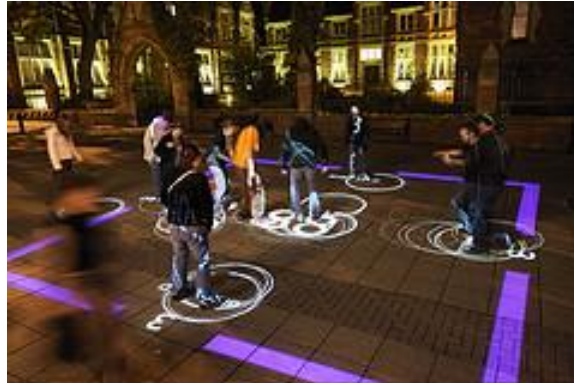
"Five Courts" at Light Night.

The sides of each square represented goals into each of the other four cities, so the court in Sheffield had four goals marked "Bradford," "Hull," "York," and "Leeds." If you kicked a ball into the Hull goal, it would appear in the court in Hull. At the end of a set time period, the winning city's name would appear in the centre of all five courts. This was a popular event, running for one night only. The concept behind "Dancing in the Streets" has also been employed on a much larger scale in KMA's installation "Flock" in London's Trafalgar Square in 2007 and "The Hive" in Dublin, 2008.