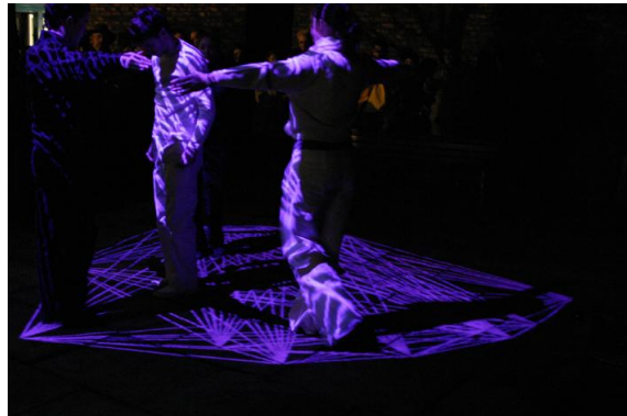
Figure 1: Cat's Cradle linking users.

People out shopping or on their way to restaurants and nightclubs found themselves followed by ghostly footprints, chased by brightly colored butterflies, playing football with balls of light, or linked together by a "cat's cradle" of colored lines. As they moved within the light projections, participants found that they were literally dancing in the streets!