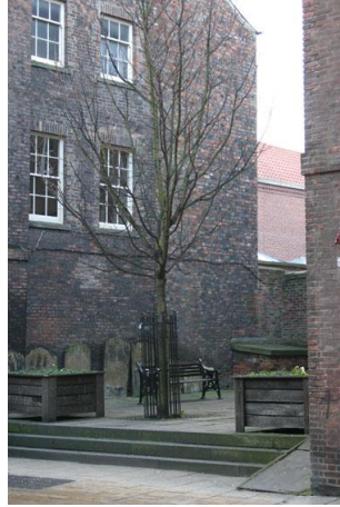
The square in which the installation was located.