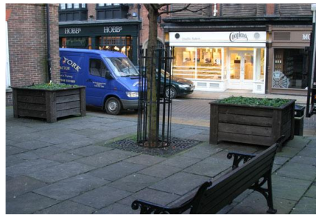
Looking out onto Davygate from inside the square.