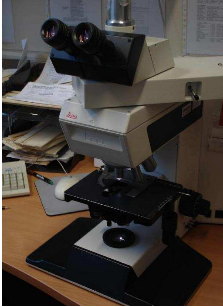
Fig. 1: The conventional microscope