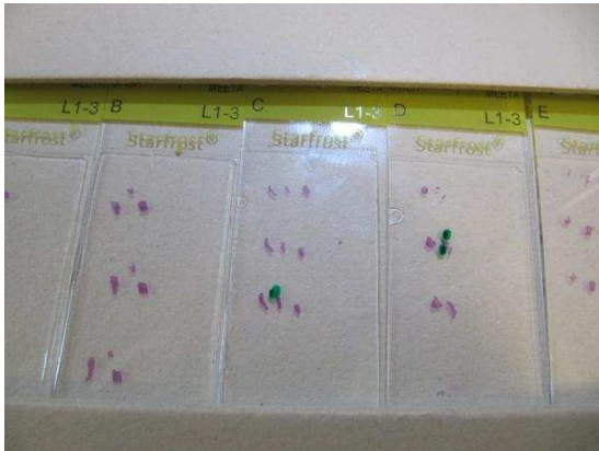
Fig. 6: Annotating areas of concern

'I'm going to put a dot next to them because this will be reviewed at the MDT meeting [marks areas of concern with a pen]. So that will save whoever's doing the review, it won't be me because I don't go to that meeting, so that person can find my dots and not have to spend a lot of time reviewing the case in its entirety.' (CH3)