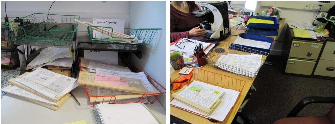
Fig. 3: Document trays for organising cases

On his desk, CH8 has a number of trays for organising his work, including an 'in tray'. One labelled 'special stains' contains cases where CH8 is 'waiting for stuff', e.g. waiting for additional slides, waiting for slides from the archive. Having sorted through his pile of cases, CH8 puts the non-urgent ones in the back of his in tray, while the high priority cases sit in a pile on his desk, so that he can start with those. The cases that he has finished with – he has authorised and finished the paperwork – sit in a tray on the floor. CH8 also has an additional tray on his desk for when things get busy.