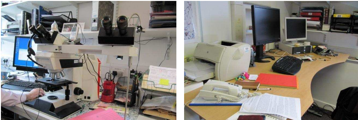
Fig. 4: Different layouts

A noticeable feature of the histopathologists' offices was the different physical layouts in terms of where the computer was placed in relation to the microscope. Those who regularly used the laboratory information system had the microscope and the computer next to each other, so that they were able to refer to information on the computer while working at the microscope. In contrast, others had their microscope on a different desk to the computer, separating these two aspects of their work.