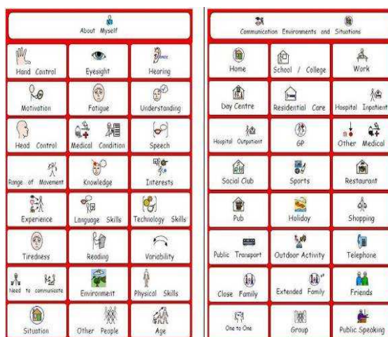
Figure 2. Examples of symbolised interview prompt sheets (WLS symbols reproduced with permission)

There is an inherent difficulty in interviewing people with speech, language or communication needs in that they are often unable to give long and free-flowing responses to questions and there can be a difficulty in having an unstructured conversation around a topic. Resources were prepared, and used, during the interviews to aid involvement of the users in the interviews and this did have some success in helping participants investigate the issues around the topic (see Figure 2). There was a difficulty, however, in helping participants to discuss the topic in more general terms and the use of the resources did significantly lead the interviews.