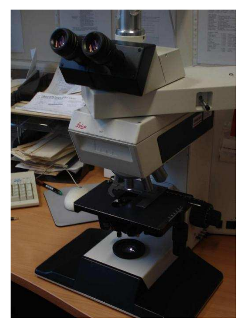
Fig. 1: The conventional microscope