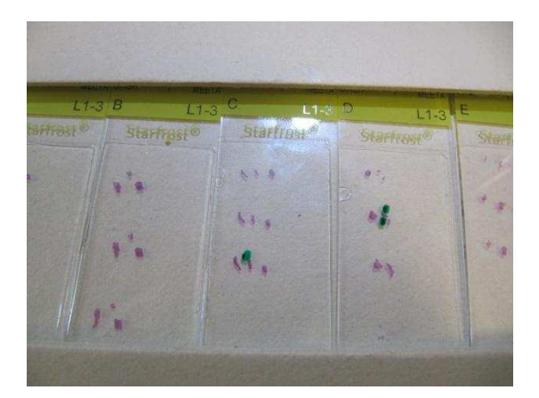
Fig. 6: Annotating areas of concern

'I'm going to put a dot next to them because this will be reviewed at the MDT meeting [marks areas of concern with a pen]. So that will save whoever's doing the review, it won't be me because I don't go to that meeting, so that person can find my dots and not have to spend a lot of time reviewing the case in its entirety.' (CH3)