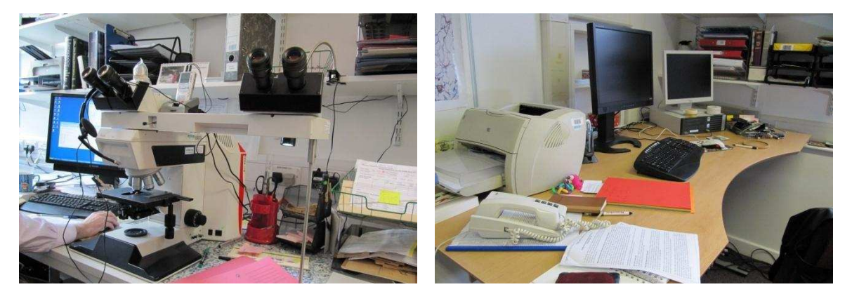
Fig. 4: Different layouts

A noticeable feature of the histopathologists' offices was the different physical layouts in terms of where the computer was placed in relation to the microscope. Those who regularly used the laboratory information system had the microscope and the computer next to each other, so that they were able to refer to information on the computer while working at the microscope. In contrast, others had their microscope on a different desk to the computer, separating these two aspects of their work.