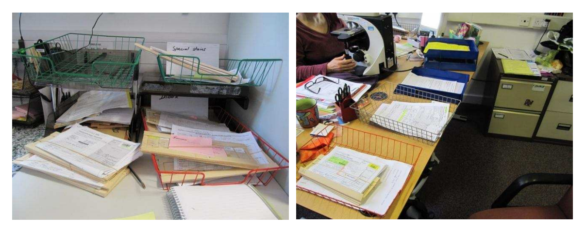
Fig. 3: Document trays for organising cases

On his desk, CH8 has a number of trays for organising his work, including an 'in tray'. One labelled 'special stains' contains cases where CH8 is 'waiting for stuff', e.g. waiting for additional slides, waiting for slides from the archive. Having sorted through his pile of cases, CH8 puts the non-urgent ones in the back of his in tray, while the high priority cases sit in a pile on his desk, so that he can start with those. The cases that he has finished with – he has authorised and finished the paperwork – sit in a tray on the floor. CH8 also has an additional tray on his desk for when things get busy.