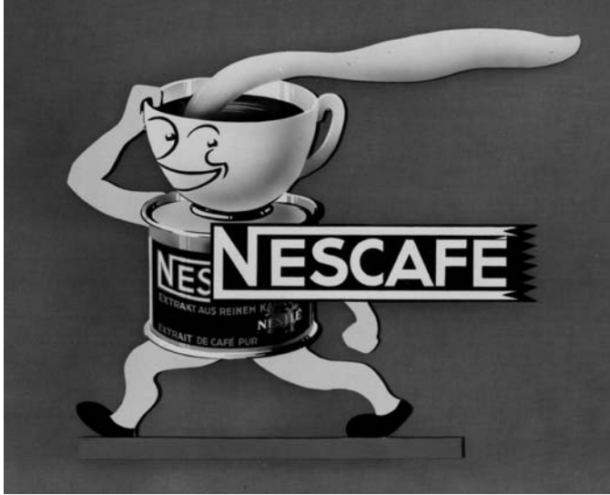
A 1939 advertisement for Nestlé.