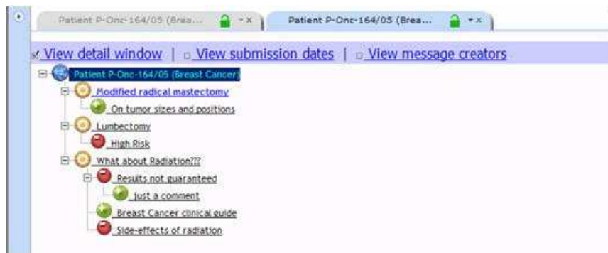
Fig. 2: A formal view of the collaboration workspace shown in Fig. 1.

exhibit a high level of formality . In particular, the formal view (Fig. 2) enables the posting of messages which can be of type issue (to indicate the decisions to be made) alternative (to represent potential solutions to the issues discussed) or position (to comment on alternatives or on other positions). Positions either support or are against alternatives and positions and their relationship are explicitly specified when users post them to the collaboration workspace. Files can be attached to positions to further support their validity. The formal view supports also the notion of preferences, used to weigh the importance of two positions and reflect the importance of one position over another. Decision making support algorithms (e.g. a voting or a multiple criteria decision making), which are associated with the CW, can take into consideration the relationships of positions as well as existing preferences and calculate which alternative is currently prevailing or which position has been defeated. The aim of the formal view is to make the CW machine understandable and to further support decision making .