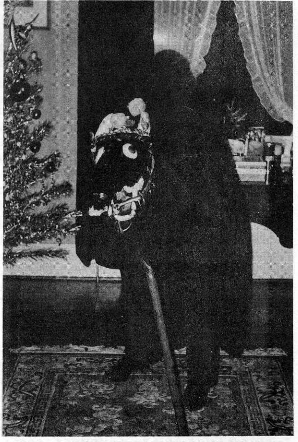
The Old Horse House Visiting Dore, Sheffield. January 1st 1972.

"Hare & Hounds", Dore, Sheffield. January 1st 1972.