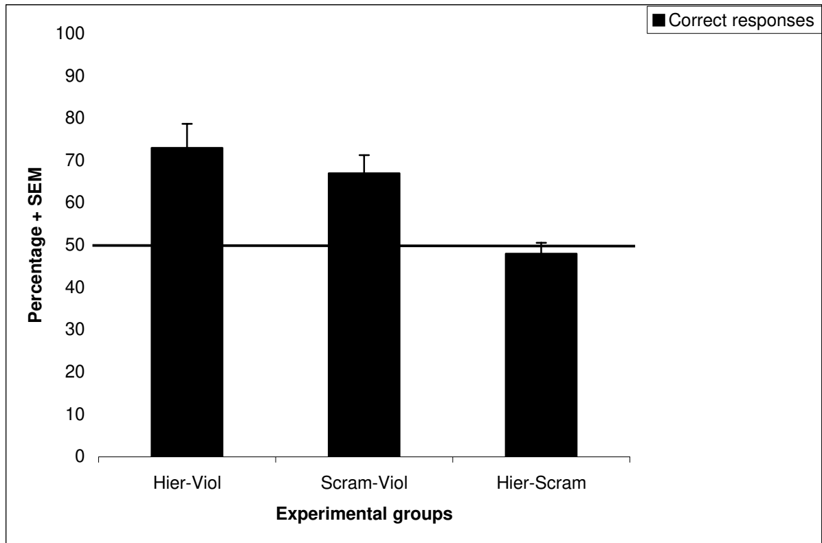
Figure 1. Experiment 1: Mean correct responses by Group. Error bars indicate standard error of the mean.