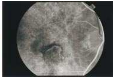
Figure 1 Patient IV:4. (A) Right fundus. (B) Right fundus fluorescein angiogram, transit phase.

(Fig 2). Pattern electroretinograms were totally extinguished in right eye, and just recordable in the left.