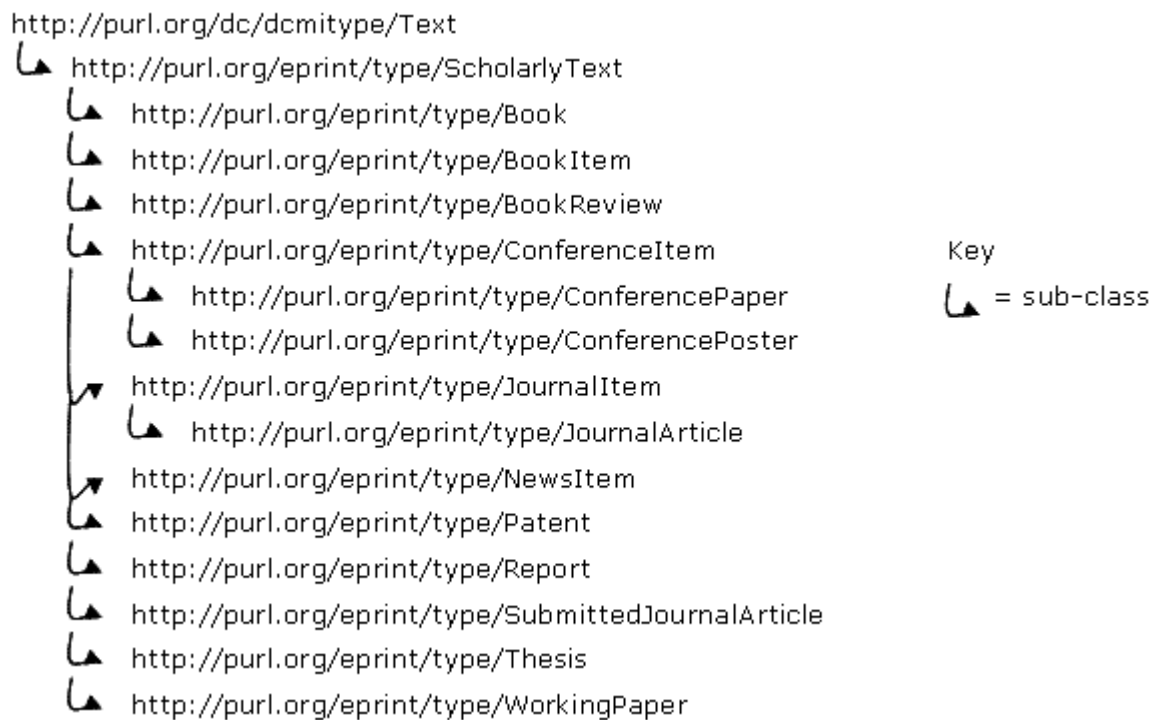
Figure 3: the eprints type vocabulary