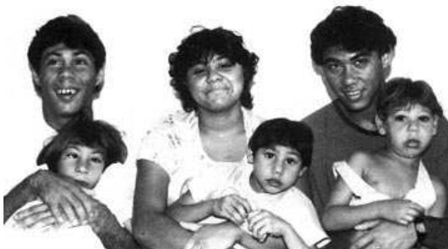
Figure 1 Six of the eight affected subjects with ages between 4 and 27 years with a diagnosis of autosomal recessive primary microcephaly.

Linkage to the five known MCPH loci was ruled out (data not shown). An autosomal chromosome screen for regions of shared homozygosity was performed on seven of the eight