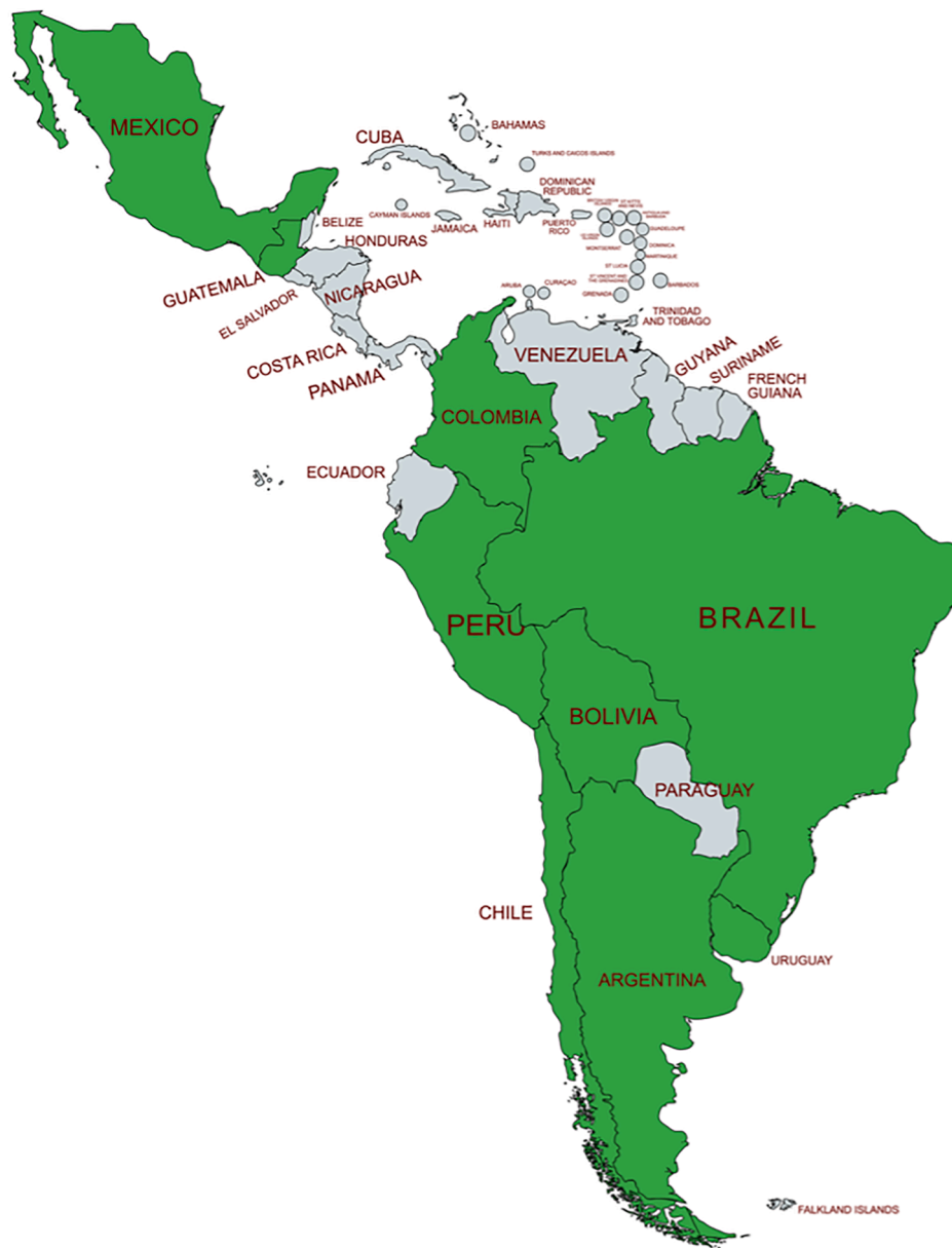
Fig. 2. Countries with available post-stroke rehabilitation guidelines. Map created using mapchart.net.